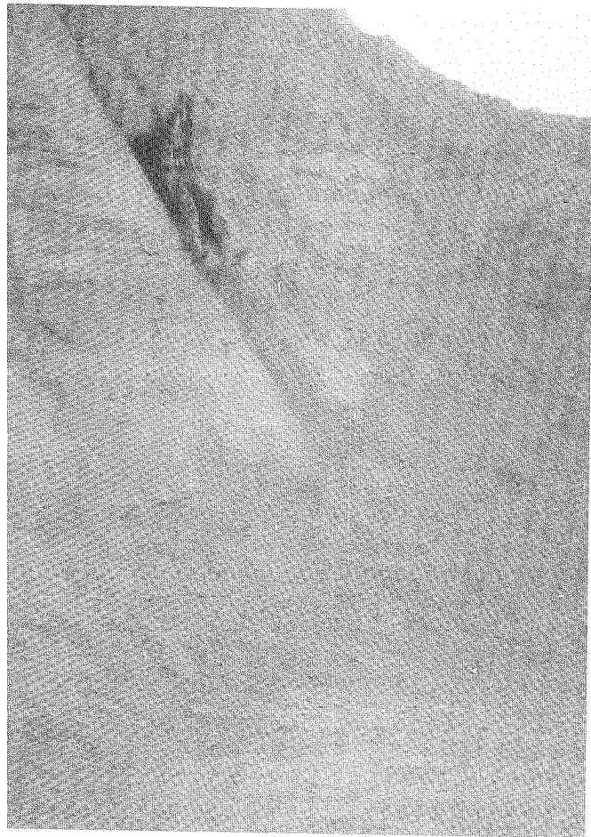
Left & below: Soldiers from Viking Force engaged in training on the Isle of Mull, April 1942