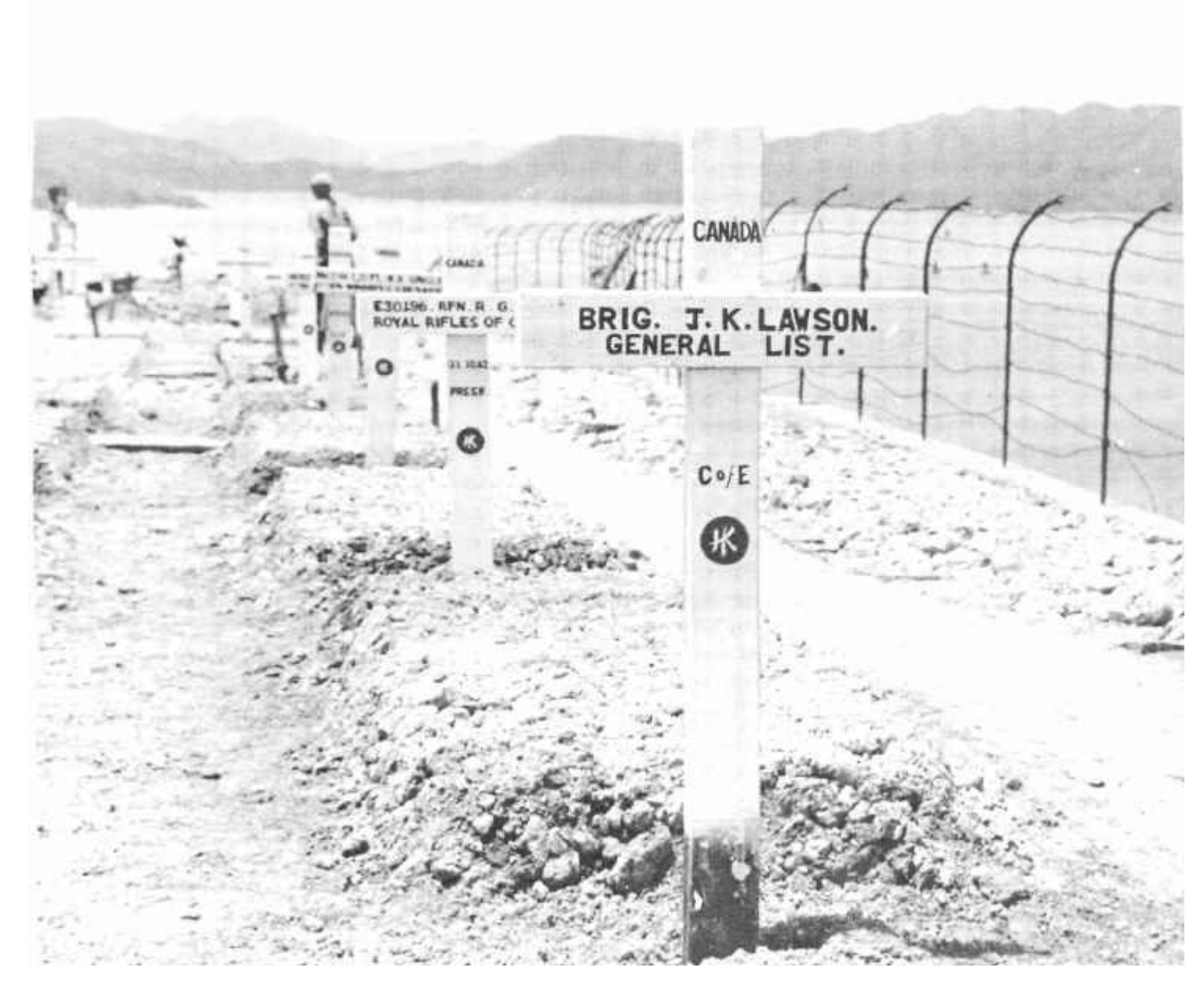
Sai Wan Militanj Cemetery, Hong Kong.

In the early morning of the 24th Brigadier Wallis held a discussion with Colonel Home and the senior officers of the Royal Rifles of Canada who were all firmly convinced that their men could do no more. For five days and nights the Royal Rifles, the only infantry battalion remaining under Brigadier Wallis' command, had borne the brunt of the attack and counter-attack; they had had little opportunity to rest and for long intervals had gone without food. Untrained, they had bought their knowledge at a heavy price, their hardships and casualties being the greater for their total lack of battle experience. Discussions over the telephone between the brigadier and General Maltby followed. Eventually it was understood that the Canadians would be withdrawn into reserve at Stanley Fort, but that the defence of the Stanley Peninsula would continue."