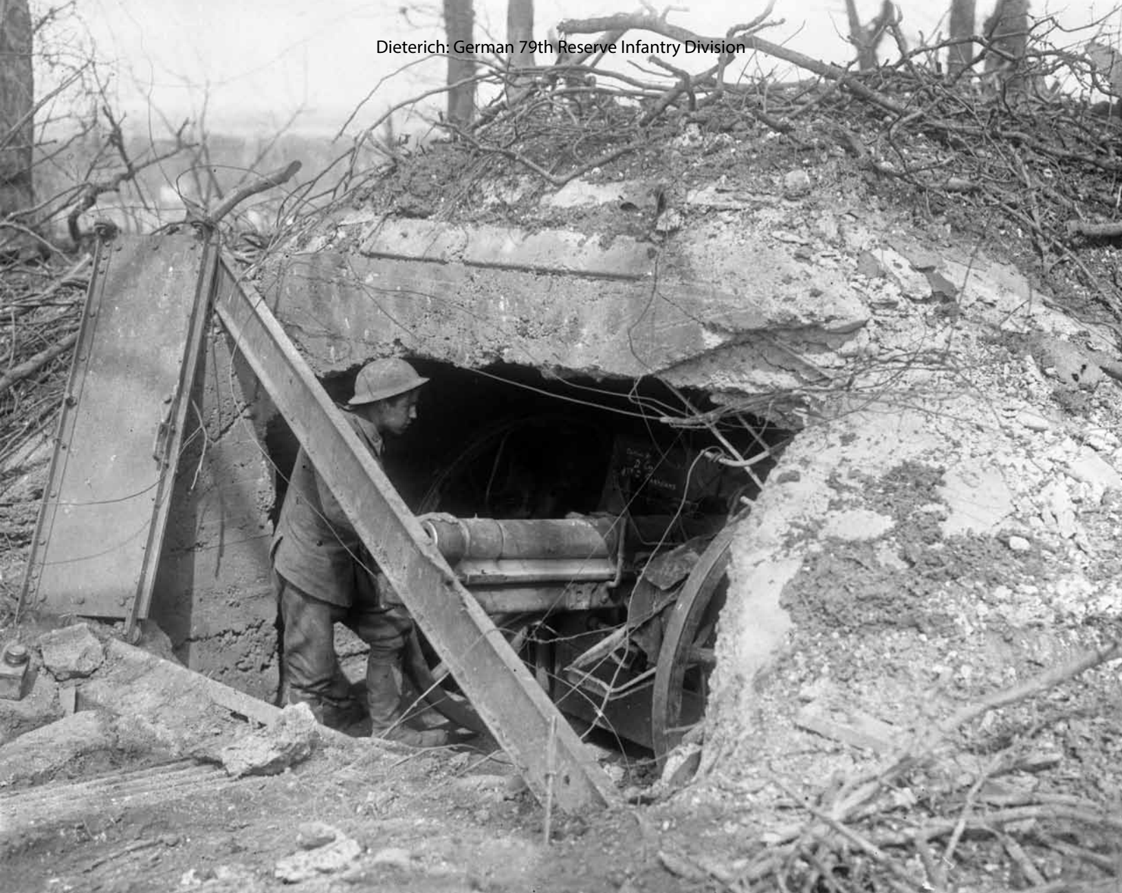
A Canadian soldier contemplates a German gun emplacement that appears to have sustained a direct hit from Allied artillery fire.

artillery munitions were fired than in the first week of the Somme and in the second week of Vimy six and a half times as much as in the second week of the Somme.