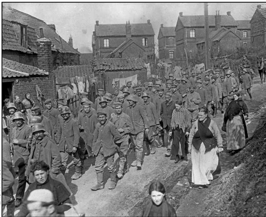
LAC PA 1160