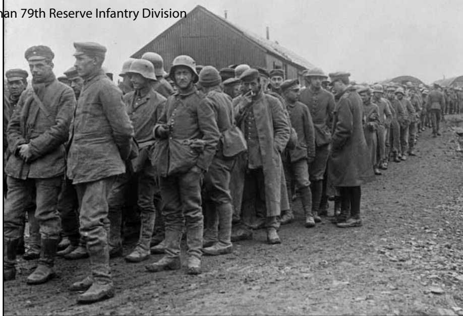
LAC PA 1190

of Vimy, and in order to avoid the ever increasing English shellfire had to go over the shallow trenches. Only towards 1800 hours did Major von Block's troops stride through Vimy. After the expulsion of the Canadians from the ruins of the village in the late evening, darkness and snowstorms hindered a rapid continuation of the attack. The second position was reached and the right made contact with the left wing of the 262nd Regiment and supported itself on its left on the Forest of la Comte. The counterattack from the troops advancing on the left from the embankment made slow progress, and the shock troops of the 1st Bavarian Reserve Division were still a long way to the rear, advancing southward. They stayed locked on the military route from Vimy to Farbus under heavy artillery fire, from where they were finally pulled back to the embankment by their Regimental commander. Overnight, in the midst of the snowstorms, all contact stopped. As the Brigade regrouped for battle the next day, the 3rd Battalion of the 34th Regiment (without two Companies) along with several machine guns transferred from the Division were put at the disposal of Lieutenant von Behr. This allowed the occupation of the south side of Vimy so that contact