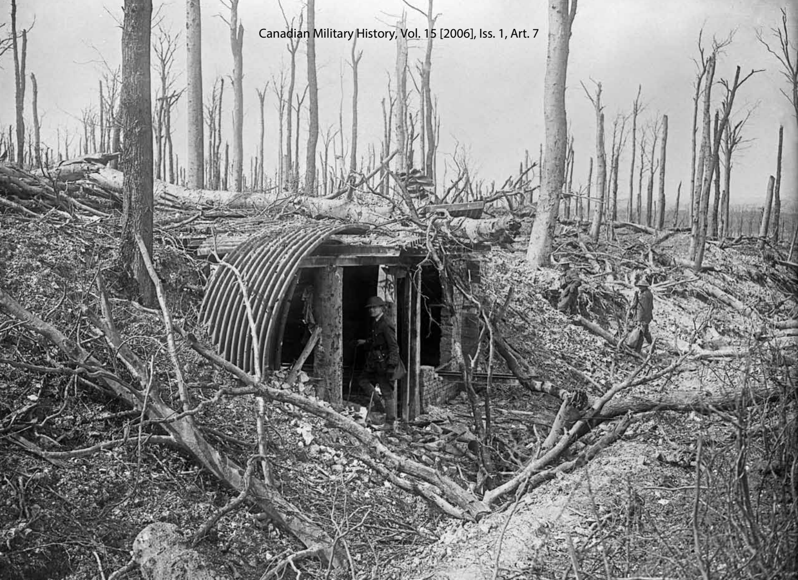
A Canadian officer explores a battered German shelter in Farbus Wood, April 1917. A network of German gun emplacements and underground shelters were concealed in the wood.

hearts to surrender. After brave opposition, the resistance of Section Arnulf was overcome.