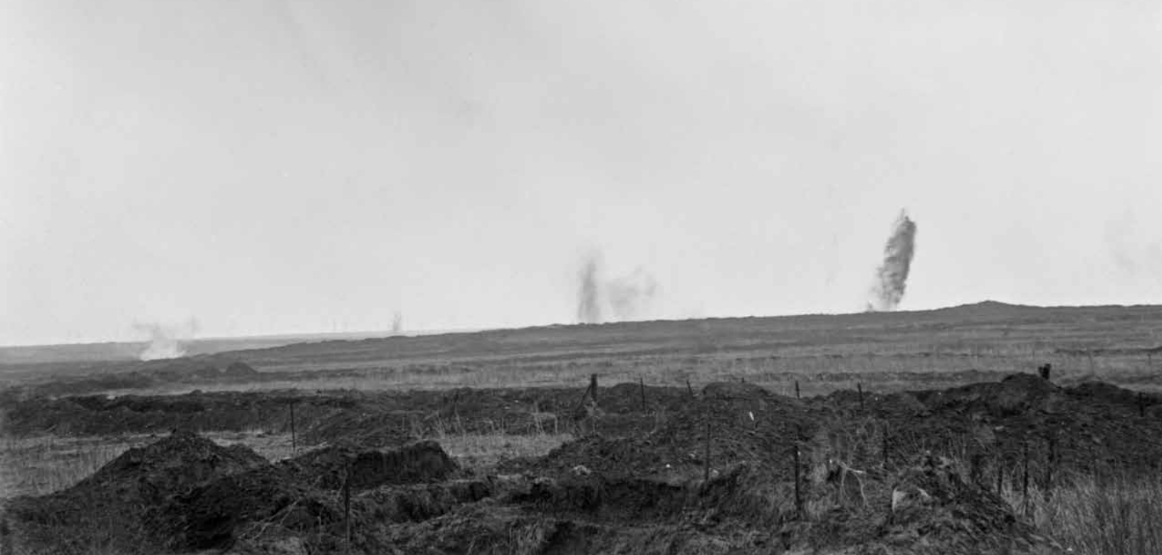
British gunfire falls on Vimy Ridge, April 1917.

case: in the 1st and 2nd lines there were 1 to 2 companies, and 1 to 2 companies behind that as a security force for the 3rd line, the rest stayed in reserve for the battalion commander. The trench strength of the companies varied between 50 and 90 riflemen. This shrunk considerably before the beginning of the big attack. Since the battalion reserves had shrunk down to a few groups because of Messenger posts, the Division had a company move forward into the battle zone from each reserve battalion immediately before the major battle, where they stayed with the Infantry Pioneer Companies as a weak reserve for the regiment. At the end of March, six machine guns of Machine-Gun Section 20 were deployed, and with the other machine guns hidden deeply in the cratered landscape. In conjunction with the few still operable mortars, they formed the solid skeleton of the very thinly manned positions.