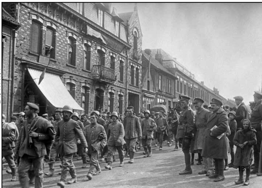
LAC PA 1191