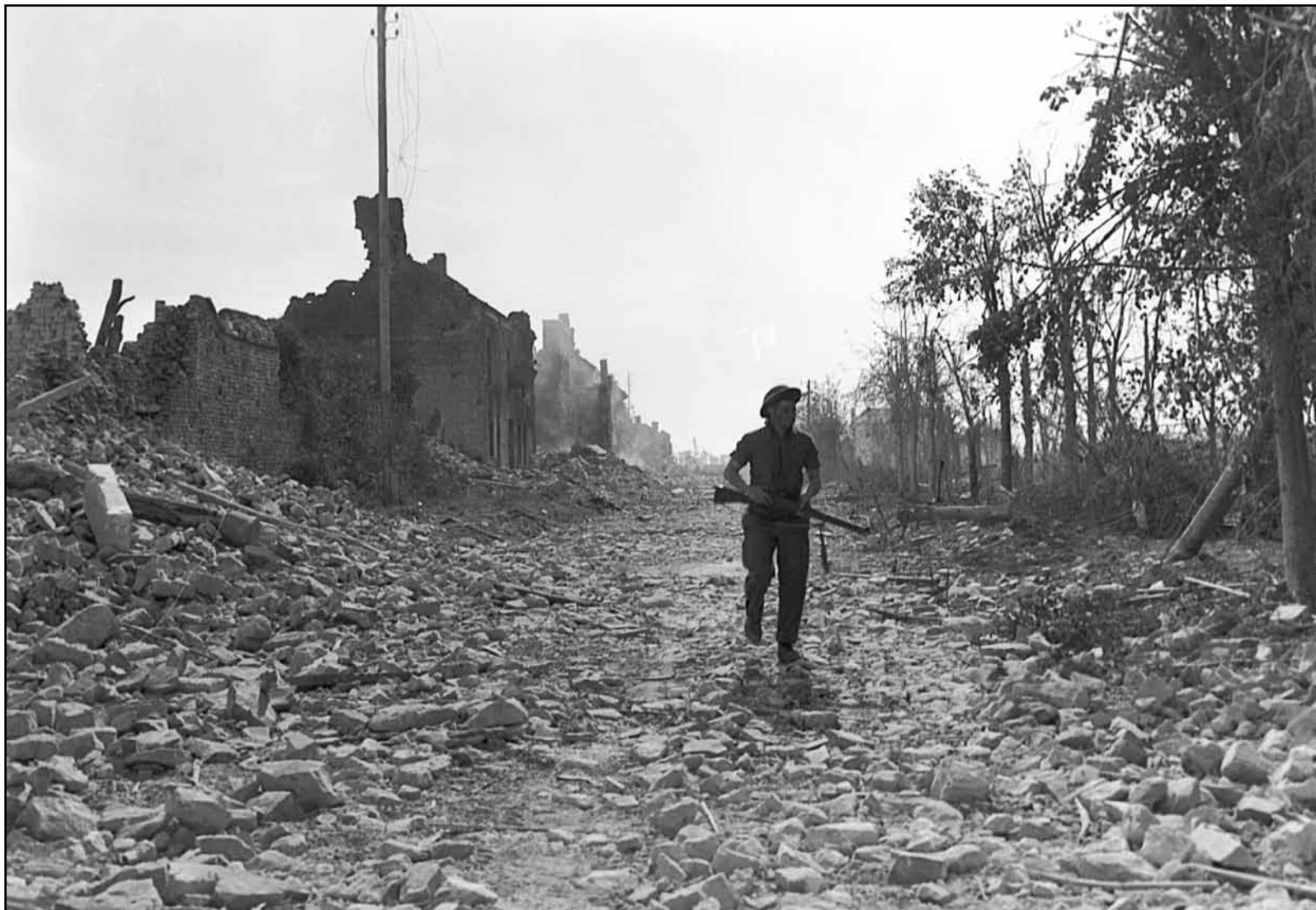
A Canadian soldier walks through the ruins of May-sur-Orne, 9 August 1944.