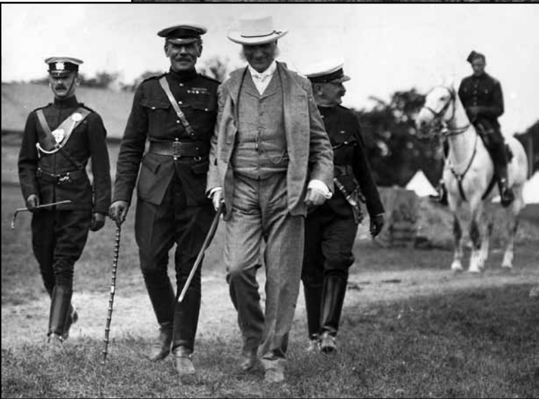
Above: The Royal Canadian Regiment at Rockcliffe, Ottawa, 1899. "Going out for work."

CWM 19910162-003 p.55-2 (top) CWM 19910162-004 p.6 (middle)