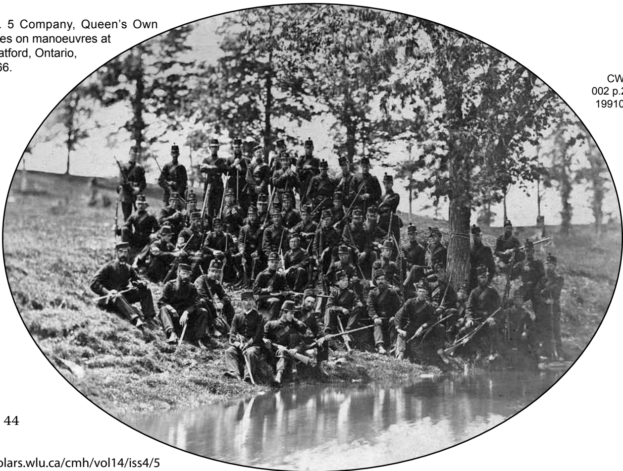
No. 5 Company, Queen's Own Rifles on manoeuvres at Stratford, Ontario, 1866.

CWM 19910162-002 p.26 (top) CWM 19910162-002 p.17 (bottom)