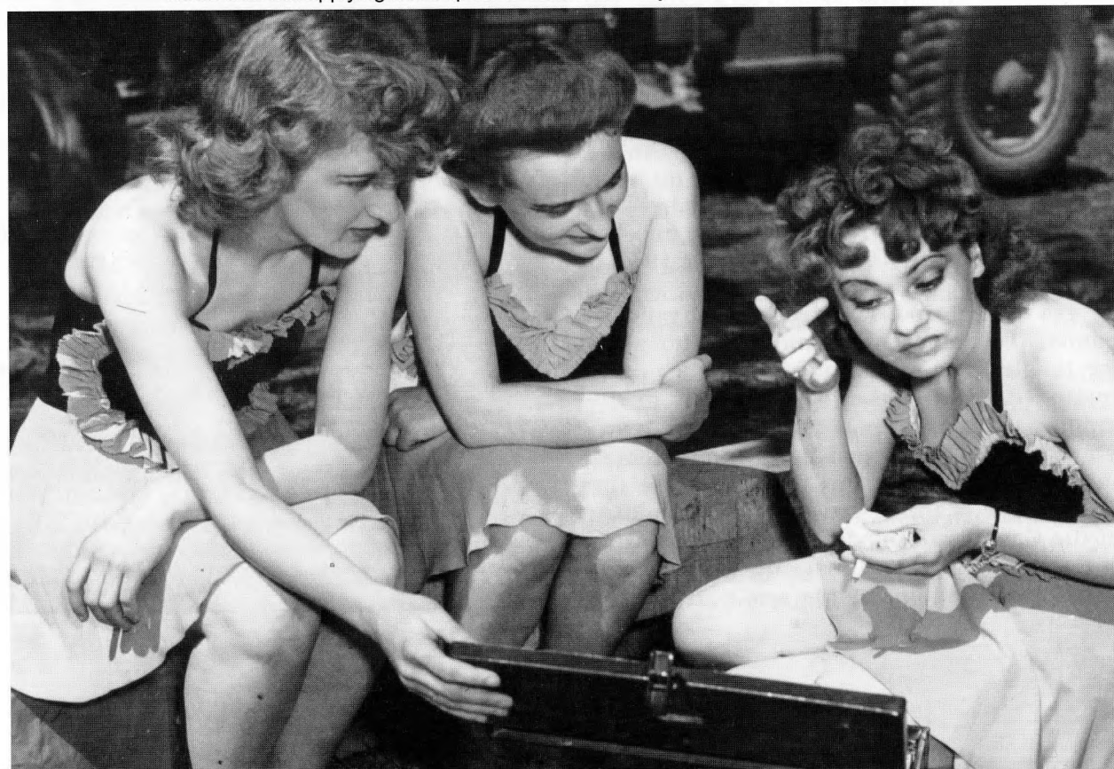
Three CWACs applying makeup for a Canadian Army Show in France, August 1944.

The three branches of the military each had their own entertainment units made up of performers drawn from their own post-basic training personnel but their formations, structure and life cycles were quite varied for groups that had fundamentally the same operational goals. Without exception, the purpose of the entertainment groups was to increase morale among the troops and facilitate recruitment to the services. It also represented a means by which the military could control service personnel's off-duty hours: military-generated diversions meant servicemen could stay on their bases and be watched over by their officers and the military police.