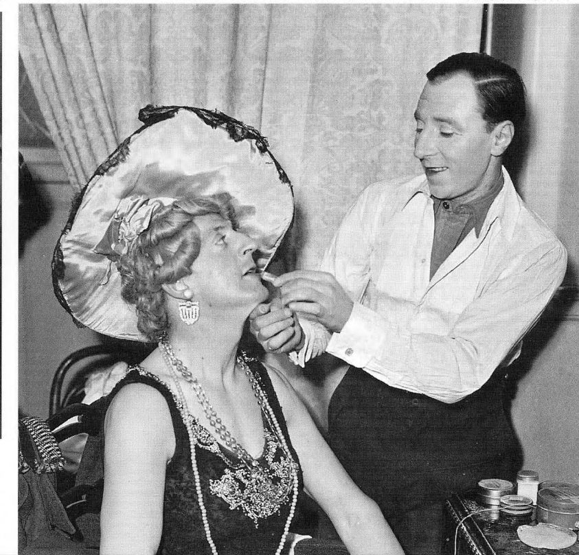
Right: Two members of the Kit Bags prepare for a show in London, 30 March 1942.