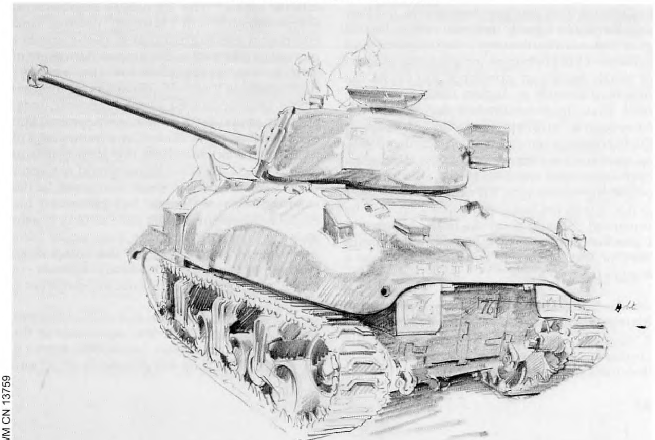
CWM CN 13759