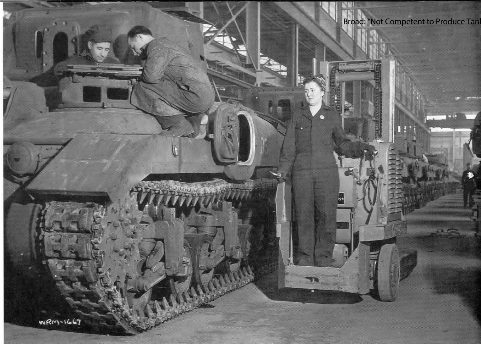
Ram tanks in production at the Montreal Locomotive Works, July 1942.

The loss of nearly a year's lead-time on military orders had serious consequences. Industry received its first orders for tanks in May 1940, but a year passed before the first Canadian-built tank, an already obsolete Valentine, appeared. The prototype of the Ram followed in July 1941. 25 Full-scale production did not begin until early 1942, by which time the Sherman was already rolling off assembly lines in the United States. Between the inception of the idea of Canadian tanks and actual production lay a jungle of administrative, economic, technical, and military confusion. The central problem was perhaps the most elementary one: Canadians knew virtually nothing about designing, building, or testing tanks, simply because there were hardly any tanks in Canada to begin with. That tanks were something new under the sun is evidenced by contemporary accounts of their development in Canada in which the authors struggle to find language to describe vehicles which most Canadians had never seen: "The tank," wrote Maclean's Frederick Edwards, "is comparable to a submarine, only the tank is smaller," while