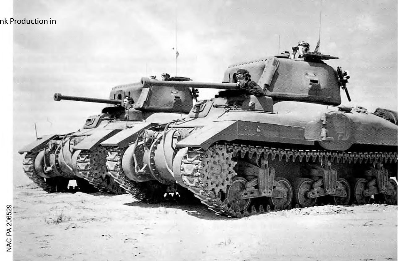
NAC PA 206529

With tank development, the question about mass production is more difficult to answer. There are fewer examples to judge by: only the Valentine and Ram were produced in any quantity in Canada. Nonetheless, most indications are that something like mass production was achieved with tanks in Canada. Despite the enormity of the administrative and engineering problems facing the Ram's designers, the actual rate of production met or exceeded expectations once the Ram entered the manufacturing stage. Moreover, Canadian production was not afflicted by a desire to produce what the British official history calls tanks built to the "Rolls-Royce" standard. 59 The emphasis in Canadian manufacturing was on