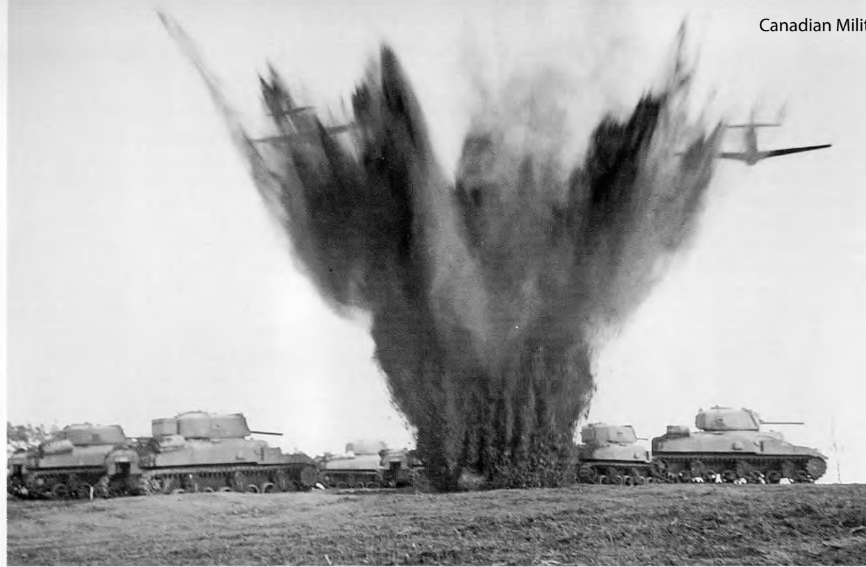
RAF Mustang aircraft fly over Ram tanks of the 4th Canadian Armoured Division during an Air/Tank Cooperation exercise, Aldershot, England, 22 December 1942.