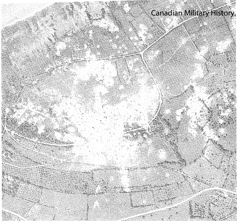
WLU Air Photo 100/4003

An aerial reconnaissance photo taken on 31 July 1944 showing the German gun battery at Houlgate.