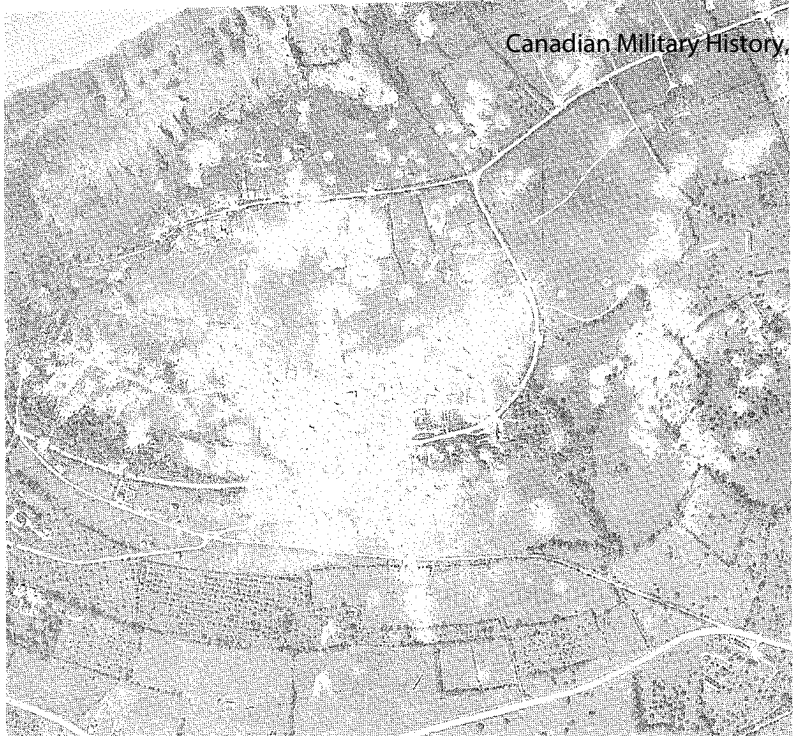
An aerial reconnaissance photo taken on 31 July 1944 showing the German gun battery at Houlgate.

what we had seen seemed to be of interest. Why the indifference, we thought? Certainly nothing was said to confirm that it was indeed the beginning of the big drive to liberate Europe. The usual routine warning was given before leaving the hut, "Remember chaps, no talk, no one is to know about what you did or saw. Get some rest now in case you are called out soon." We began to realize that this was what we should expect on such a special occasion.