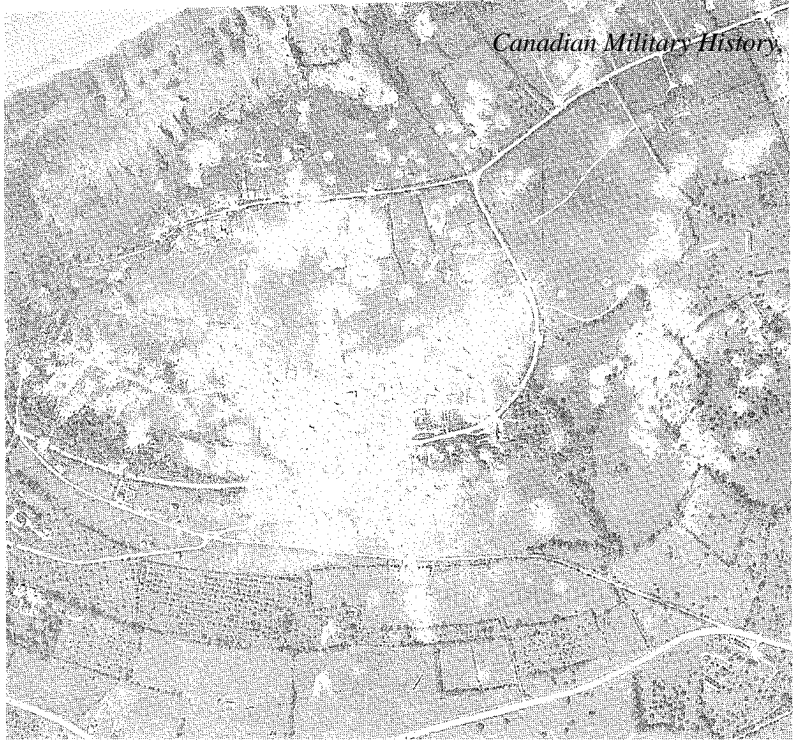
WLU Air Photo 100/4003

An aerial reconnaissance photo taken on 31 July 1944 showing the German gun battery at Houlgate.