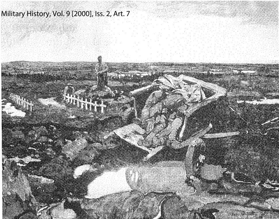
For What? Painted in 1918 by Fred Varley (1881–1969)