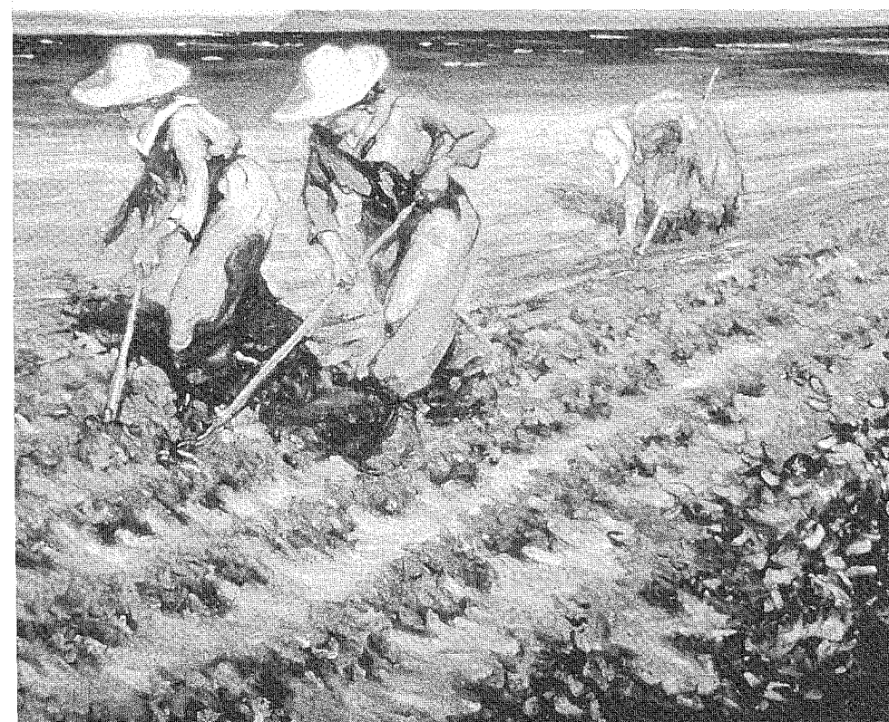
▼ CWM CN 8390