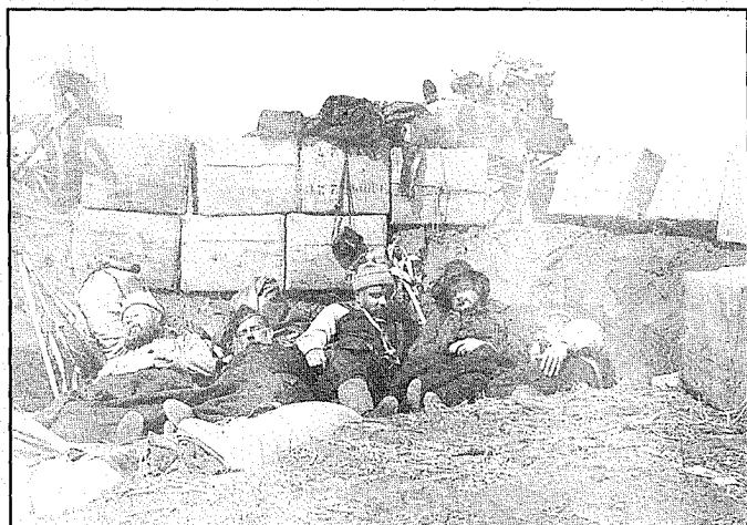
"Asleep in the Trenches"

Peters also recorded military life within the confines of what other photographers had already done. This shot catches the spirit of troops becoming accustomed to campaigning, and is reminiscent of Fenton's images from the Crimea. Moreover, it also illustrates another feature of the campaign for us. In reality it is not in the trenches at all, but shows a corner of Middleton's "zareba", a term he borrowed from North African warfare for a shelter constructed of circled waggons reinforced with boxed supplies and hay bales, supported by well-sited rifle pits. As a place of refuge at night, it was, perhaps, analogous to the Roman fortified camp. It protected the militia's soldiers, horses and supplies from nighttime depredations by the Métis, whom Peters saw as "the best skirmishers in the world." 13