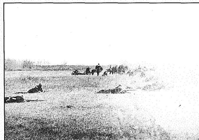
"A Battery Supporting the Guns"

Much more important for the military historian than the previous photographs are the sometimes-blurred shots of action itself. Most instructive are a sequence taken at Fish Creek. The militia's scouts in their advance to contact tripped the Métis ambush. In "First at Fish Creek" we see the militia vanguard gone to ground, unfortunately skylined for the Métis hidden in the wooded, reverse slope coulee in the background. In "A Battery Supporting the Guns" is the reality of late nineteenth century infantry tactics -- skirmishers firing prone toward an unseen enemy. Both these images bring us much closer to the "empty battlefield" of the twentieth century than to the massed infantry of the Crimea or even of the American Civil War.