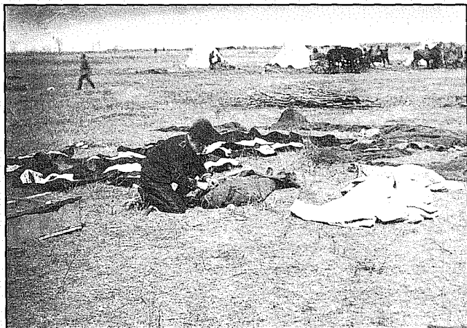
"Sewing Up the Dead"