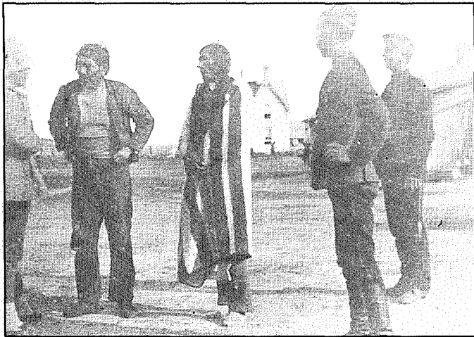
"Poundmaker in Blanket"

Peters produced a number of photographs of the Indian chiefs coming to headquarters either to surrender or to proclaim their loyalty. These catch the ambivalence of powerful men caught in the uncertainty of a position which they cannot control and their attempts to retain their dignity.