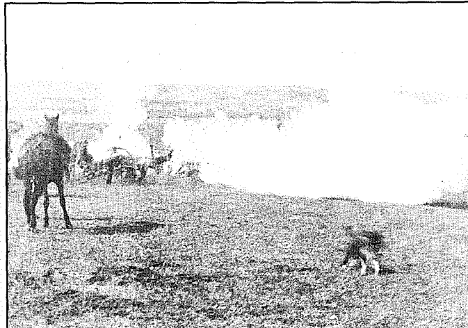
"General Meeting Priests"