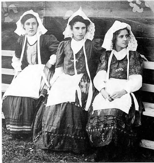
Maidens of New France rest before an Historical Pageant.

represent the views of the Montreal garrison, met with the Minister of Militia, Sir Frederick Borden, on 11 May, while the London Advertiser reported that plans were now being "subjected to extensive alterations in the direction of reduction." Two days later it was announced that militia summer training would proceed as usual, but that a mere 5,000 troops would be financed by the Department to participate in the Tercentenary. Borden cited the Battlefields Commission as being responsible for making arrangements for the troops at Quebec and further clouded the issue with reference to the difficulty in obtaining special trains during the peak immigration season. As a compromise solution it was a failure, and Colonel Sam Hughes berated the Minister with inflammatory questions in the House. Toronto's Mail and Empire trumpeted "NO MUSTER OF CANADA'S ARMY ON QUEBEC BATTLEFIELDS," while the Halifax Herald's headline of 19 May was "Extravagant As To Grafters But Parsimonious As To A Great National Demonstration." Readers of the latter were reminded that "Now, everybody must recognize, in the light of custom and existing fashions, that the military display must be looked to as the prime feature of all such celebrations."