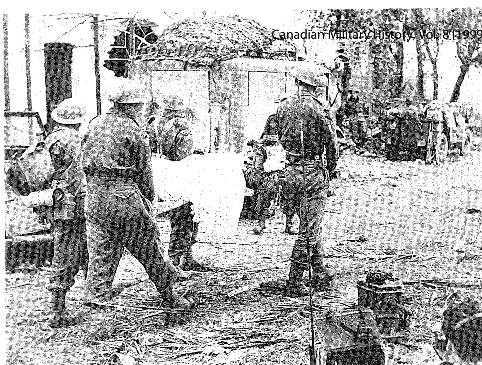
Archives du Royal 22e Régiment, No. PH3/172/130

Stretcher-bearers evacuate a casualty, Italy, 1943