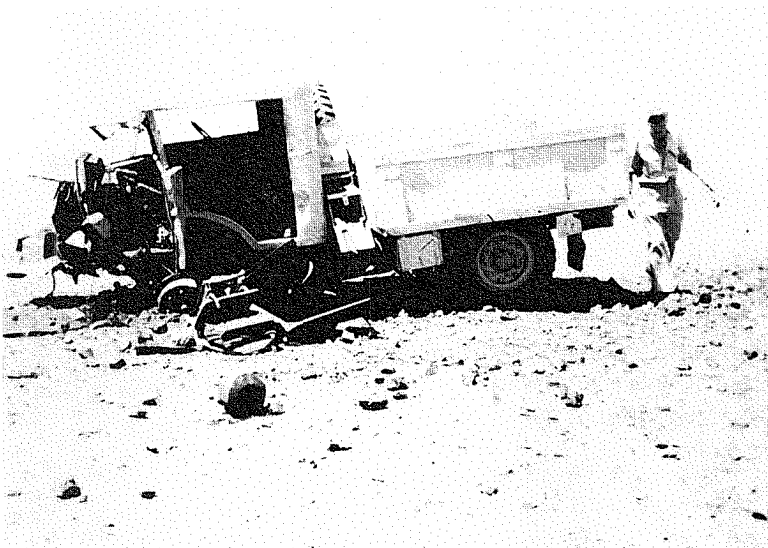
CFPU PMR 529