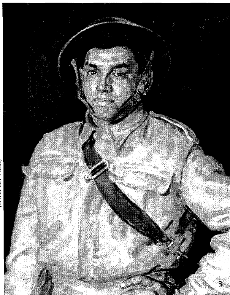
Figure 4: "A Redskin in the Canadian Royal Artillery"