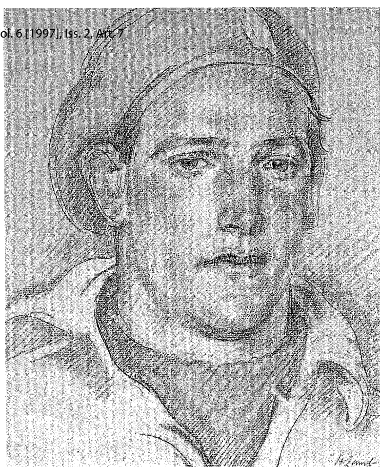
(CWM CN 7821)