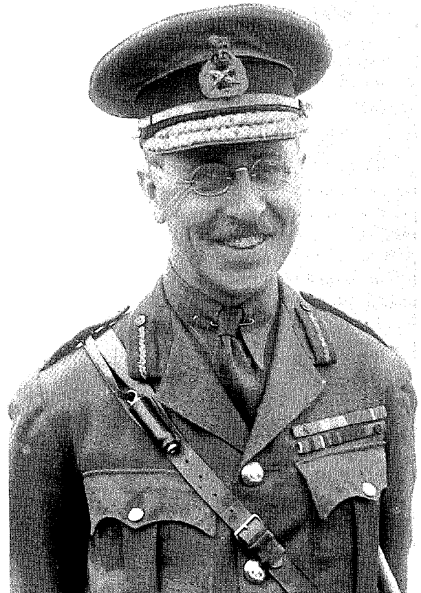
A smiling Turner shown shortly after his promotion to Lieutenant-General in mid-1917. The ribbon for Turner's VC is clearly visible above his left breast pocket.

On 1 April Plumer accelerated Turner's relief of Haldane's exhausted division by 48 hours. The relief was complicated by the Canadian Government's request that its Corps remain intact. Thus Plumer had to relieve Fanashawe's V Corps with Alderson's Canadian Corps; the British Army's first corps-for-corps relief of the war. Turner relieved Haldane on the night of 3/4 April without incident. 41