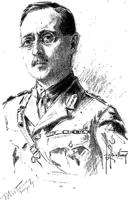
(NAC PA 7907)