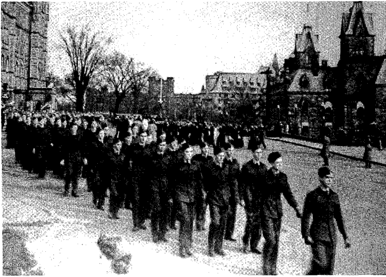
Above: Members of Lisgar Collegiate's 94th Cadet Corps parade on Parliament Hill.