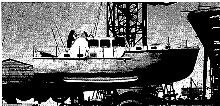
An ice-battered Pogo in Halifax after her first voyage through the Northwest Passage. Her newly attached wing keels are visible just below the waterline, May 1955.