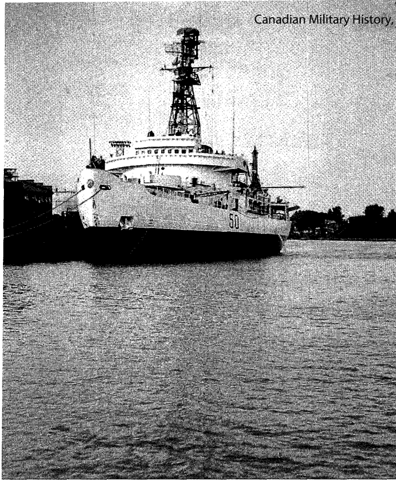
The Labrador, resplendent in her coat of Arctic white, undergoing final fitting at Marine Industries Ltd., June 1954.

Restricted in size because it had to be slung on davits on Labrador's starboard side, she had to be able to carry all of the equipment necessary for charting the Arctic waters – radar, echo sounder, a radio-transmitter, a large gyro-compass, an auxiliary compass, a 7 kilowatt generator, and a 70,000 BTU heater to keep the crew and equipment from freezing. The boat had to sleep six and have a galley with enough room to produce three meals a day. The problem of installing all of this equipment and making a comfortable working space for the crew was further compounded by the Navy's request for a full-size regulation chart table. According to the hull designer, it was one of the more trying challenges of building the Pogo . 3