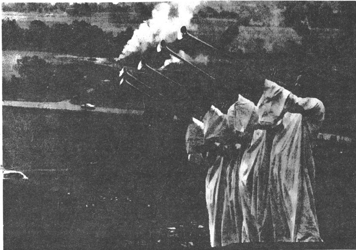
Heralds of angels harking at Dick's coming. The tune, the same old one: "Let Me Make One Thing Perfectly Clear."

In response to the drastic changes wrought in the government, veteran Nixon specialists had only one comment to make. "Let us pray," said the specialists. Popular response was something in a similar vein. Said the people, "Amen."