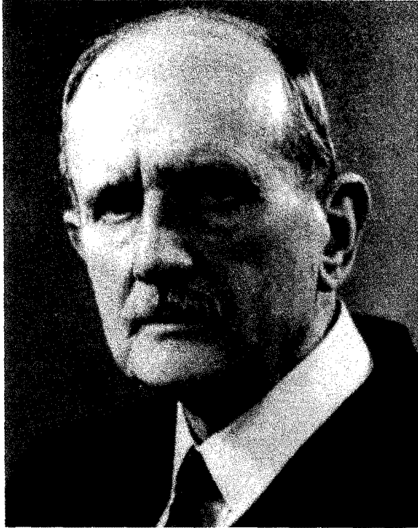
Brigadier-General Sir James Edmonds, Official British Historian of the First World War