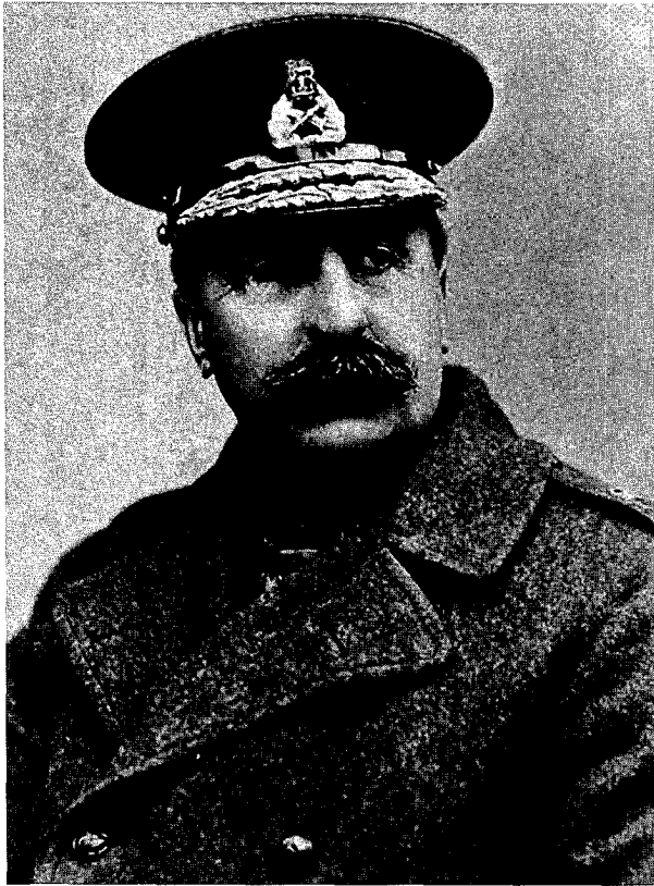
Lieutenant-General Sir E.A.H. Alderson, General Officer Commanding 1st Canadian Division.