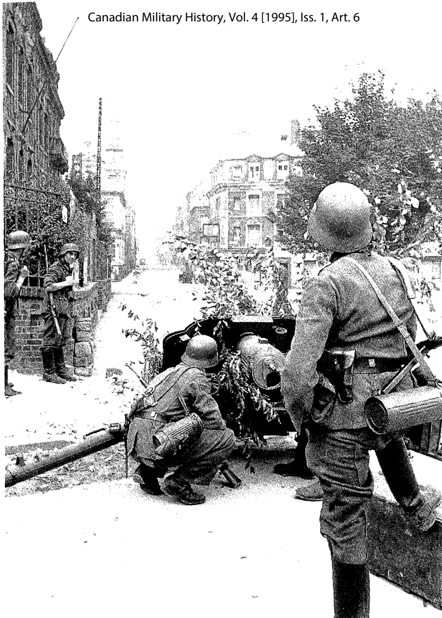
During the battle an accurately sited German anti-tank gun and crew lie in wait near the end of the Rue de Sygogne for the possible penetration of any tanks.

On the flanks, Commandes would capture and destroy the coastal batteries about five miles east and west of Dieppe, while infantry were to neutralise coastal batteries on the east and west headlands which dominated the town. 9 The Cameron Highlanders of Canada were to advance to meet the tanks of "A" and "B" Squadrons, 14 CATR, behind the town and then advance against another coastal battery, an emergency fighter airfield, and the local enemy divisional headquarters thought to be at Arques-la-Bataille. These flank attacks were an essential requirement for the success of the main frontal assault, half