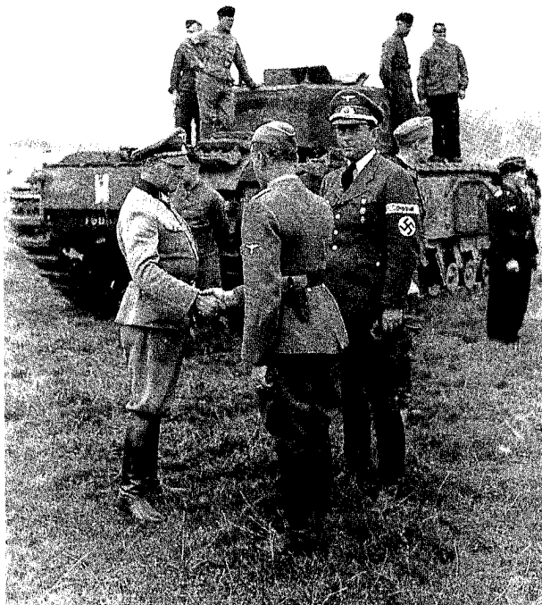
Many high-ranking German officials and officers came to inspect the aftermath of the raid. Near Dieppe, Sepp Dietrich (left) and Albert Speer (right, facing camera) examine captured Churchills and observe firing tests. In the background is CAT, which was disabled on the promenade by a hit from a JU-87 Stuka dive bomber.

probably because the charges had been damaged by enemy fire. A few crews even had to manually cut this away, either because the partially blown fabric had jammed their turret traverse or obscured their vision ports. Proper testing of this equipment under actual fire, especially during disembarking training, would have revealed its vulnerability. No arrangement was made for shedding the exhaust extensions. 31