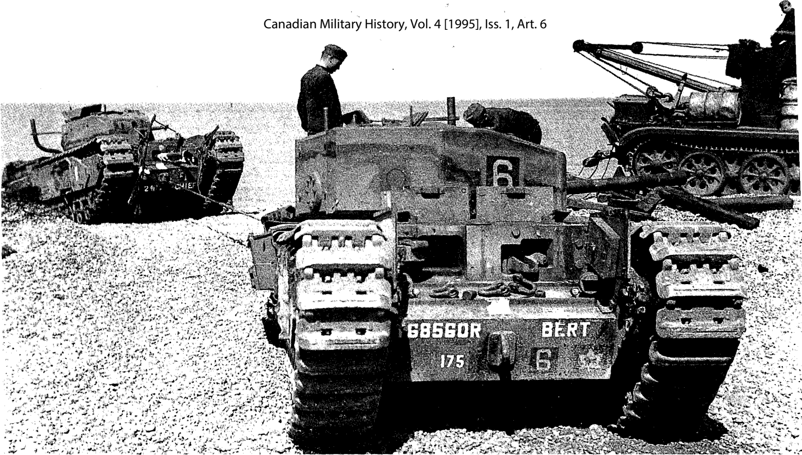
BERT was immobilized on the promenade when shell fire broke its left track. After the battle it was repaired by German engineers and is seen here towing CHIEF off the beach.

on the beach from a mortar practice carried out the previous day. Their fire plan was well laid out and beautifully coordinated." 13