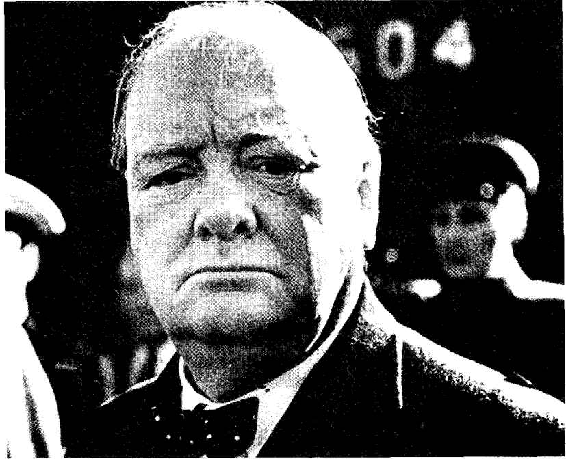
The strain of recent events shows clearly in Churchill's face at Moscow airport, 12 August 1942.

Charmley sums up his view of what happened: