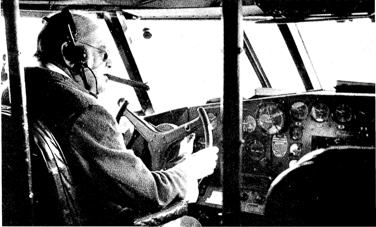
Churchill at the controls of the Boeing Flying Boat which carried him across the Atlantic on 14 January 1942.