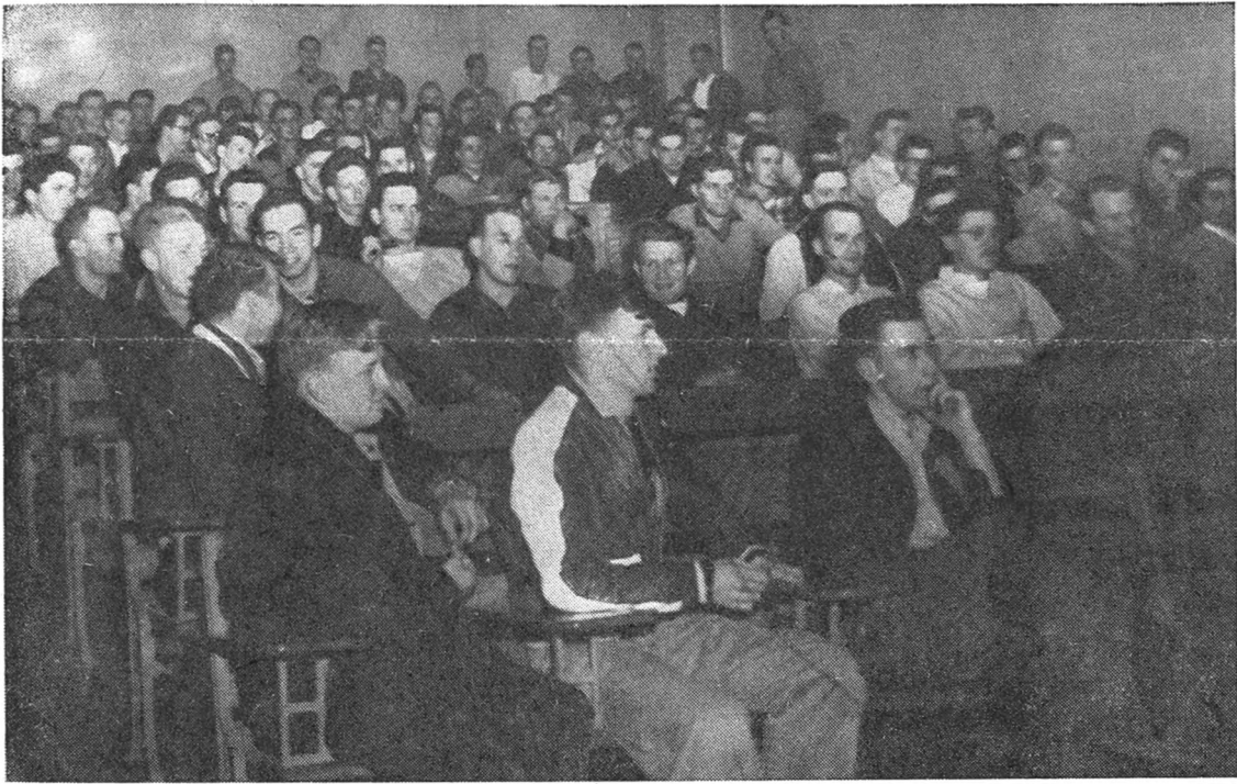
FULL HOUSE — Engineers displayed no apathy by turning out in full force for last Monday's Engineering Society meeting.