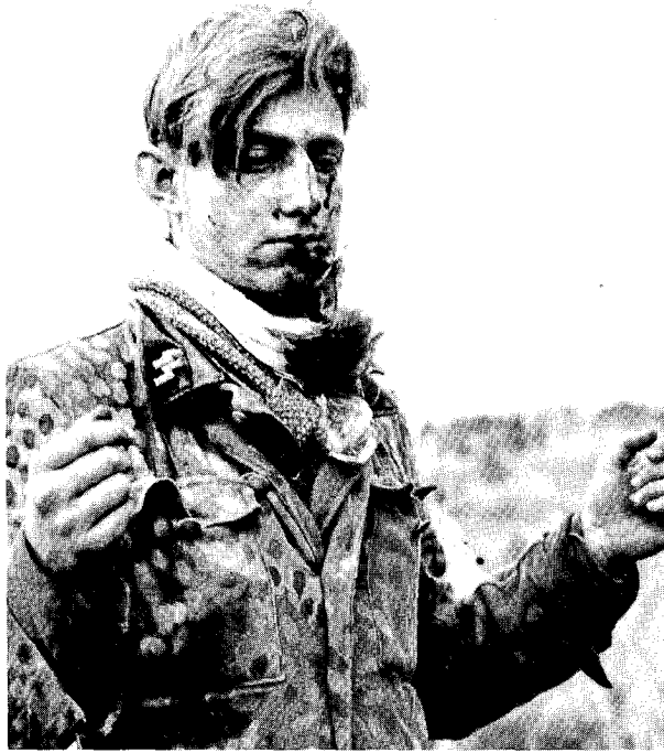
The face of defeat: a panzer-grenadier from the 12th SS captured by the Canadians.

The gallant stand of the 7th Brigade against Hitlerjugend impressed two thoughts on the mind of the German commanders. First, since the 12th SS was unable to throw the Canadians off the Caen-Bayeux highway, the planned drive to the sea was considered hopeless. General Geyr von Schweppenburg, commander of the recently activated Panzer Group West, visited Kurt Meyer at the Abbaye Ardenne on 9 June to evaluate the progress of the Hitlerjugend . On hearing the Standartenfuehrer's report, von Schweppenburg uttered a sardonic reply — “My dear Meyer, the war can only now be won through political means.” 79 The command structure in disarray, the Germans and the 12th SS were now firmly on the defensive.