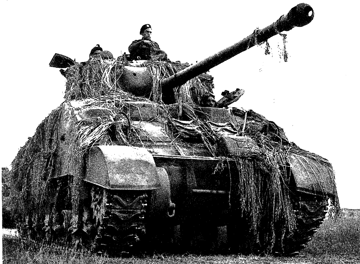
Sherman Firefly 17-pounder