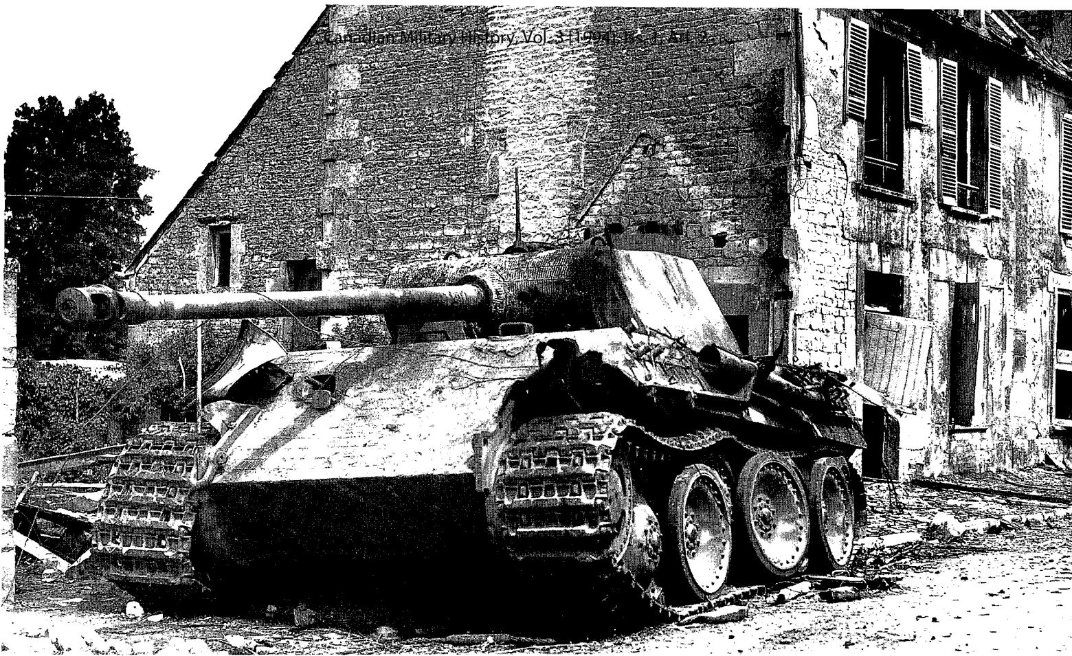
Panther knocked out by Reginas using PIATs and grenades in Bretteville on the night of 8 June.