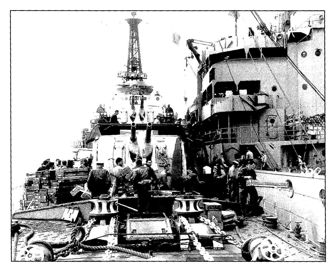
HMCS Nootka being resupplied by USS Virgo off the Korean coast. Ice cream, steaks, ammo, etc.

Certainly, there was no doubt who was the junior in the relationship. With a population of just over ten million, most of its effective military forces in the United Kingdom and with more on the way there, Canada was a virtual supplicant, seeking the help of the 125 million-strong United States to defend its homeland in a world suddenly made unaccustomedly perilous. There was every sign of this in the negotiations over a strategic defence plan for the continent when the Americans proved to be as difficult to deal with as the British had ever been. The