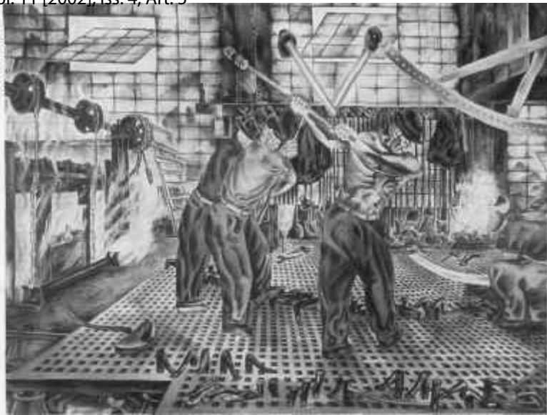
Left: Caven Atkins - Outfitting a Minesweeper at Night