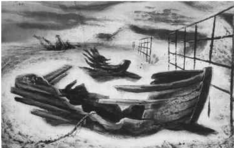
Michael Forster- Wreckage on Beach Near Newhaven, England

Michael Forster was born in India and died in England. The majority of his mature years were spent in Canada with sojourns in the United States and Mexico. Like many artists of his generation he scratched out a living as a painter of window display backdrops, and movie sets, and by writing art criticism and short stories. He painted and drew all the time and occasionally was rewarded with an exhibition. In his later years he painted for himself only and faded into obscurity.