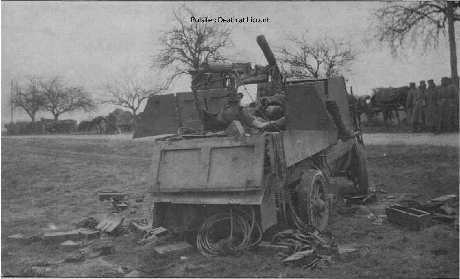
Pulsifer: Death at Licourt