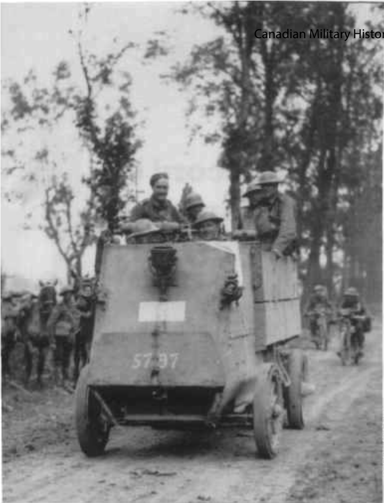
A armoured car of the 1st Canadian Motor Machine Gun Brigade.

unfailing cheerfulness of the British Tommy, the minimization of Allied losses, the belief in the inevitability of an Allied victory. 3