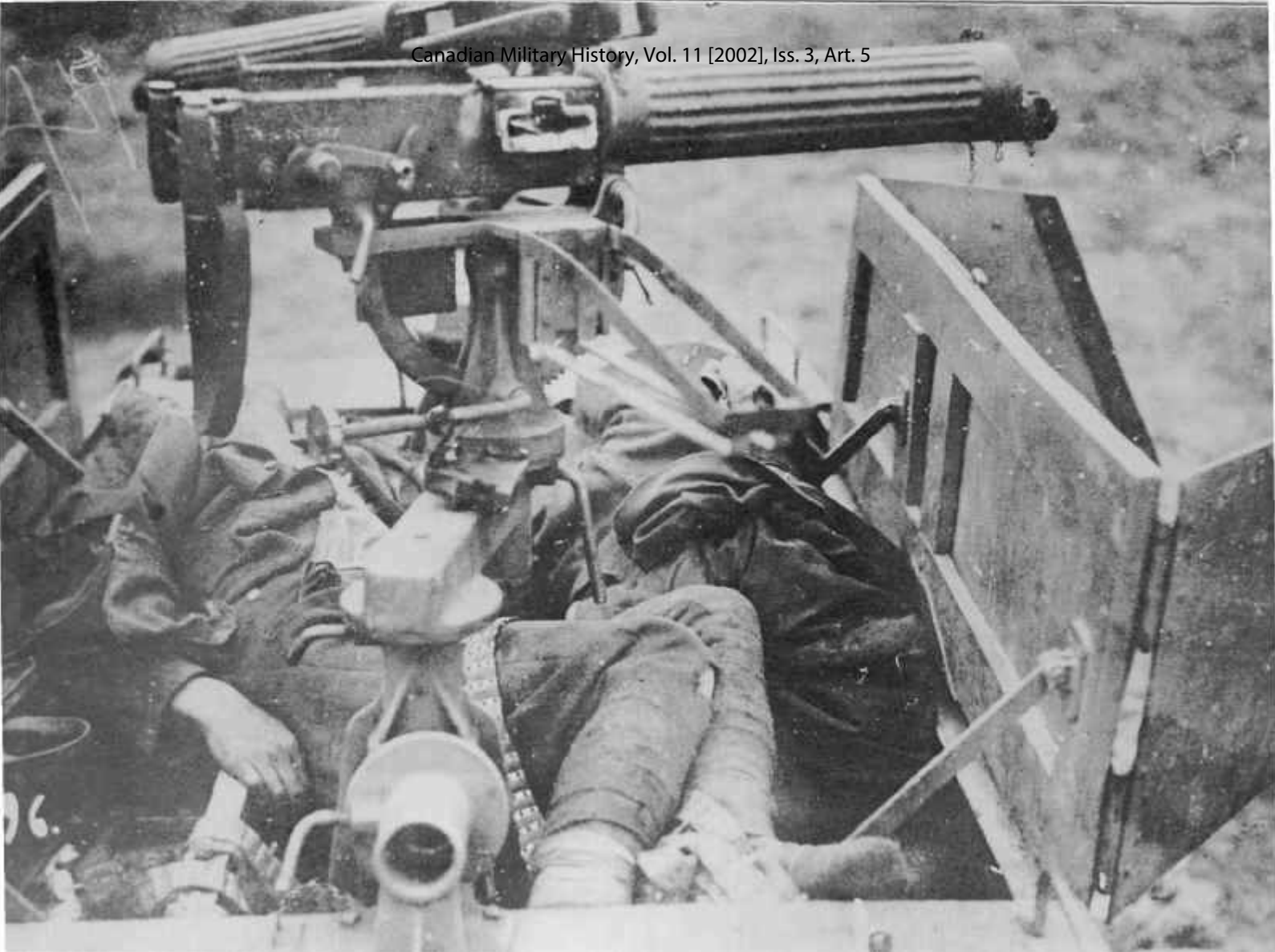
Photograph No.3 - The last of the three German photographs taken with the photographer standing in the car's cab and looking backwards along the rear.