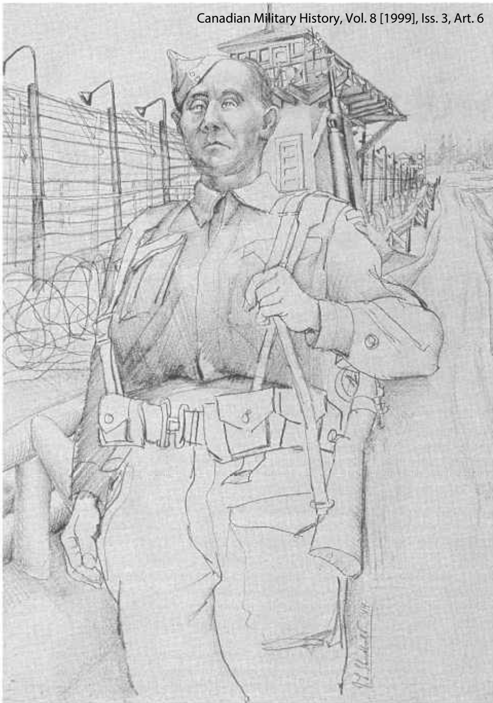
Left: A Veterans Guard on Tour of Inspection.