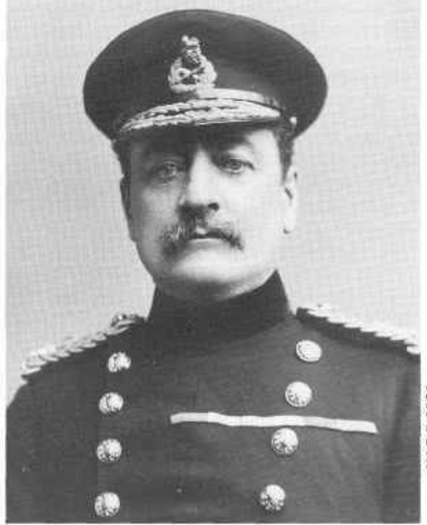
NAC C 6359

Probably an even greater obstacle to Lessard's chances, however, were the problems encountered in South Africa by Sam Hughes