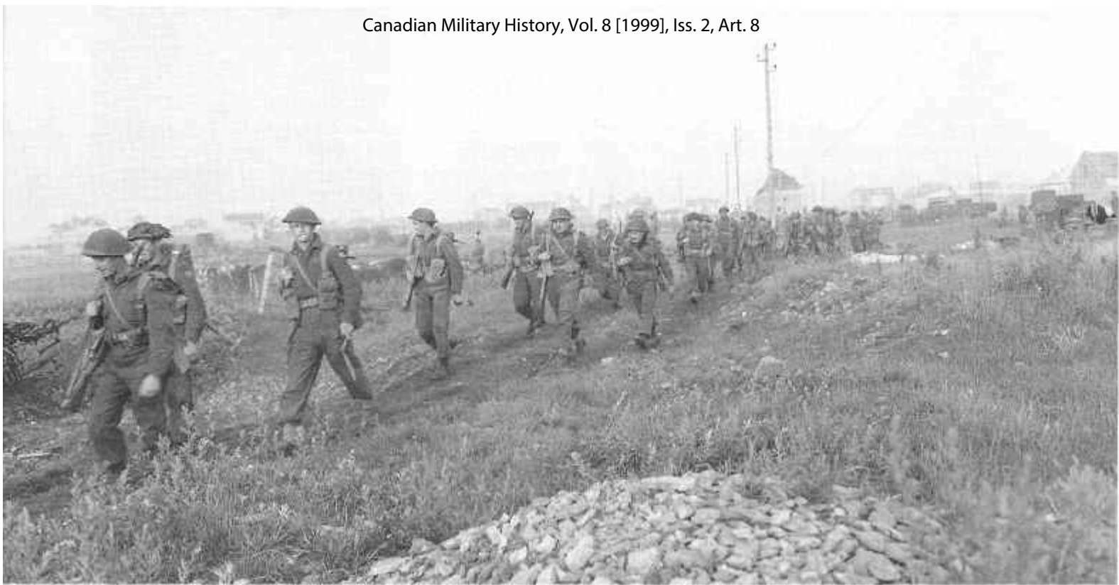
"...it will be most difficult for Commanders to put across to front line soldiers who are constantly being shot at the notion that the Boche is groggy, and also that our task in this recent battle was successful in its primary end despite the losses entailed." Canadian infantry on the move at dawn, south of Vaucelles, 25 July 1944. NAC PA 13.

or two effectively concealed 88 mm guns could knock out a whole regiment of tanks before discovered. Our mediums can still knock out the old Mk IV but the Panther and Tiger tanks are a different proposition. At the present time the solution seems to rest in the employment of heavy four-engined bombers and rocket-bearing Typhoons. A 4,000-lb "block buster" will turn over a Panther or Tiger tank on a direct hit or near-miss. Our rocket-bearing Typhoons have proved very effective during recent days, but it must be realized that in employing air support in this manner that there is a definite time-lag which gives the Boche an opportunity to recuperate from the effects of the attack by the time either our armour or the infantry get through.