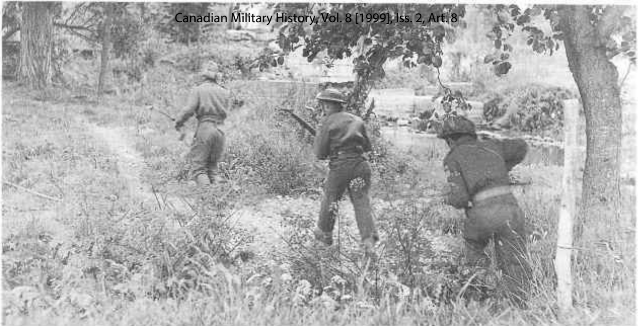
"Recce patrols should be small and made up of experts who know how to creep about in the dark and in daylight, without being observed. They must consist of men who are individualists and who enjoy the work." Canadian soldiers from the North Shore (New Brunswick) Regiment set out for a patrol in Normandy.

defined. A recce patrol goes out to get information and bring it back. Recce patrols should be small and made up of experts who know how to creep about in the dark and in daylight, without being observed. They must consist of men who are individualists and who enjoy the work. Obviously the type of man required must be one who possesses personal courage. But courage is not all that he must have. You may have a man who possesses considerable courage but who, when he crawls five feet in the dark, cannot do so without cursing. There are also men who possess great courage if they are in company with others but are ineffective if they become isolated. On the other hand, there are men who like to play alone or with a companion or two. Fighting at the present time is not confined on a continuous front - both sides have wonderful opportunities for good scouting. We must always bear in mind that the Boche keeps very still in daytime. For the experienced there are all sorts of outward signs which scouts learn to interpret. When, for instance, all movement has ceased in a village we can accept it that the Boche is there. When civilians are seen to be returning to the village, then it is a pretty fair indication that the Boche has gone.