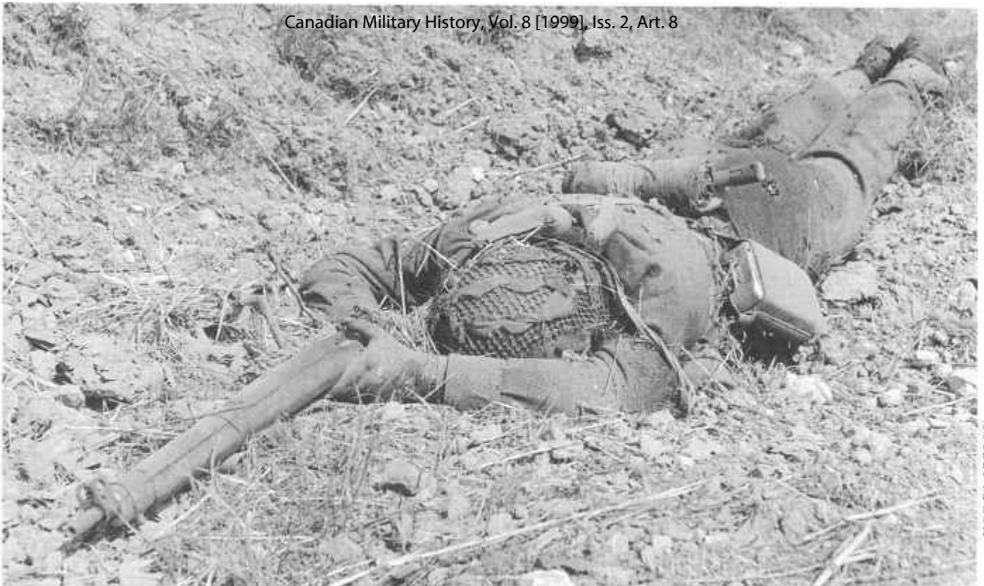
"As a Commander you must consider at the outset whether the losses incurred are going to be worth the final assault.... We can't fight the Boche without incurring casualties and every soldier must know this. " A Canadian soldier killed in action at Tilly-la-Campagne, 9 August 1944.

Cdn Inf Div's attack down to FLEURY SUR ORNE, I am certain that we went nearly through the enemy's lines. We had achieved our first objectives and we had, in particular, all the air support required and the exact targets for them. Unfortunately, the weather closed down on us cutting off our air support, and the enemy took advantage of this by putting in two counter-attacks, and drove us back from the ground we gained. In the intervening bad weather which followed, he heavily reinforced."