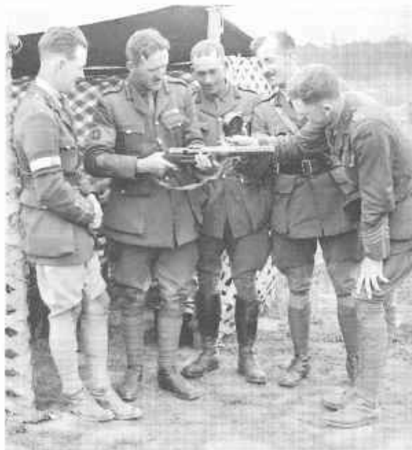
NAC PA 2941