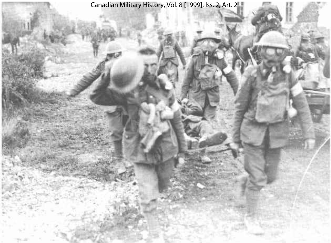
Canadian stretcher-bearers, wearing gas masks, bring in Canadian wounded.

of keeping men busy. 68 Watson's failure to understand this must surely place him, as some of his junior officers noted, in the second echelon of Canadian commanders. Although few have tried to analyse Watson or most of the other Canadian divisional commanders, it seems that he did not share Currie's strong will or desire for intricate planning. Perhaps it was a case, as one junior officer remarked, that "his personality was rather put in the shade by that of his General Staff Officer Grade I - Lieutenant-Colonel E. Ironside. The general opinion was that Ironside was the real commander of the division." 69 Although overshadowed by the towering Ironside, with more experience Watson learned from his mistakes - perhaps by more closely following Byng and later Currie's direction. Nonetheless, neither Watson nor Ironside, despite being experienced in trench fighting, exhibited good judgement in their planning - a fault that can be directly attributed to their lack of understanding and failure to devise a doctrine for poison gas. Despite an initial foray into the topic, more work needs to be done on Watson and all the divisional commanders in order to ascertain their influence on each of the four divisions and the Canadian Corps in general. 70