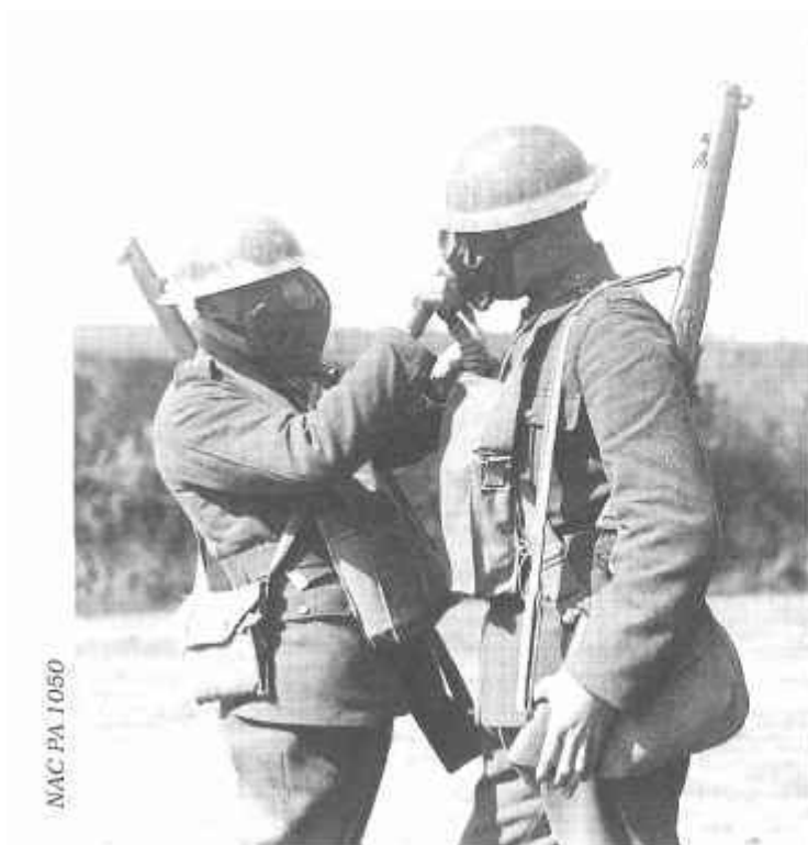
Examples of gas masks. Above, a soldier adjusts his comrade's gas mask; Right: an early style gas helmet.