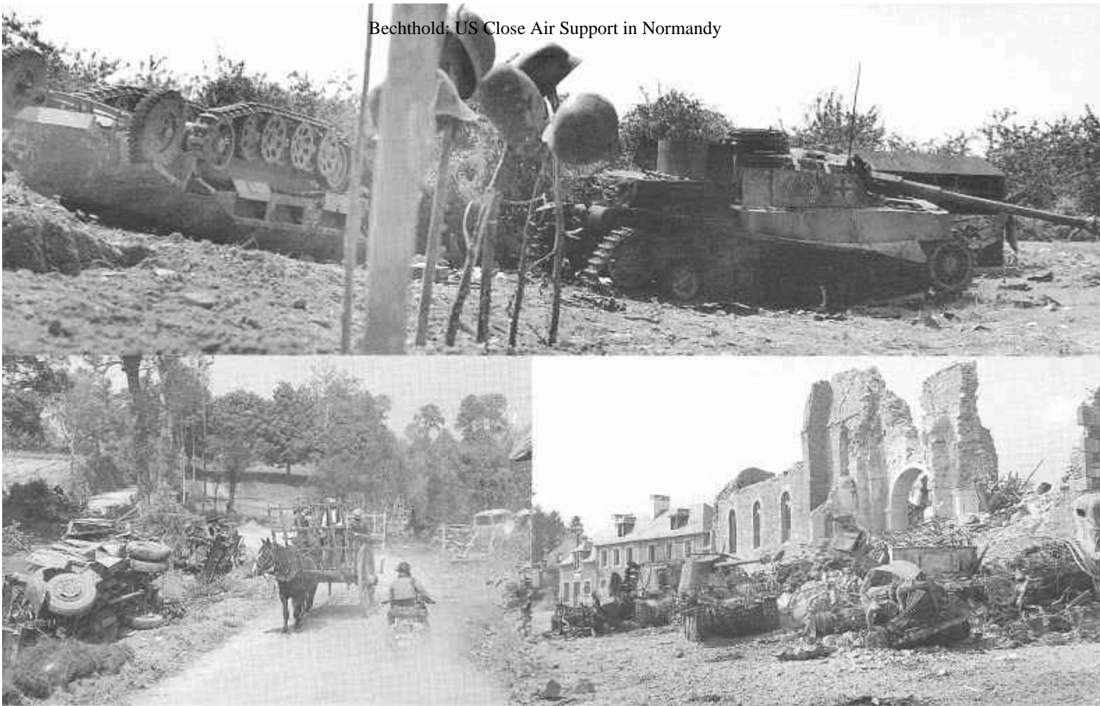
Scenes of destruction in the Roncey Pocket. Top: A German half-track (likely overturned by aerial bombs) and a knocked-out Panzer Mark IV tank bear silent witness to a row of German graves. Above left: A French farm cart and an American dispatch rider pass by smashed German transport just outside of Roncey. Above right: Wrecked German armour and transport in the square at Roncey.

received artillery support from the self-propelled guns of the 78th Armoured Field Battalion and air support from a squadron of IX TAC P-47s tasked to fly ACC for Combat Command B. German resistance crumbled in the face of this concerted attack. 45