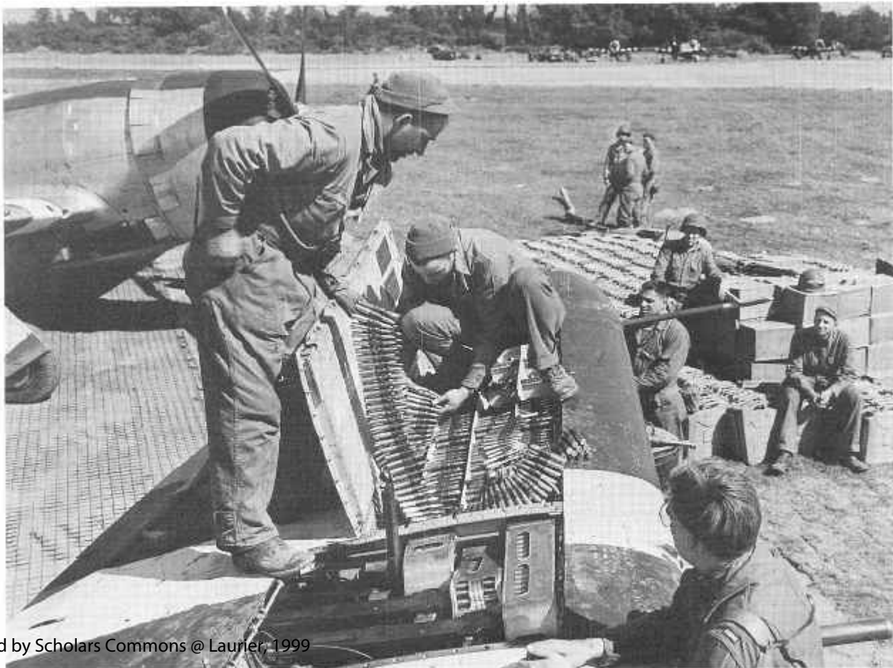
Ground crew refuel and rearm a P-47 in preparation for another sortie in Normandy.

the troops. If no requests had been received by the end of the patrol, the squadrons had orders to attack pre-arranged targets before heading home. 15 During the afternoon and early evening of 6 June, 13 requests were made. Five were refused for various reasons including weather, impending darkness, the unavailability of aircraft and coverage by other missions. The remaining eight requests were accepted and a total of 11 missions resulted. The majority of the missions were directed against gun batteries near Carentan, Maisy, Isigny and Bayeux. The importance of these targets prompted Major-General Leonard T. Gerow, Commanding General V Corps, to contact the headquarters of Ninth Air Force personally and request, "continuous fighter bomber support to search out and attack enemy artillery firing on the beaches." 16 This entreaty was fully endorsed by General Elwood R. Quesada, Commander of IX TAC. A series of attacks on the coastal batteries resulted in numerous direct hits being reported and the missions were considered to be generally successful. Other request missions carried out included armed reconnaissance of the three main roads leading from Coutances, and attacks on a number of convoys, trains and other targets of opportunity. 17