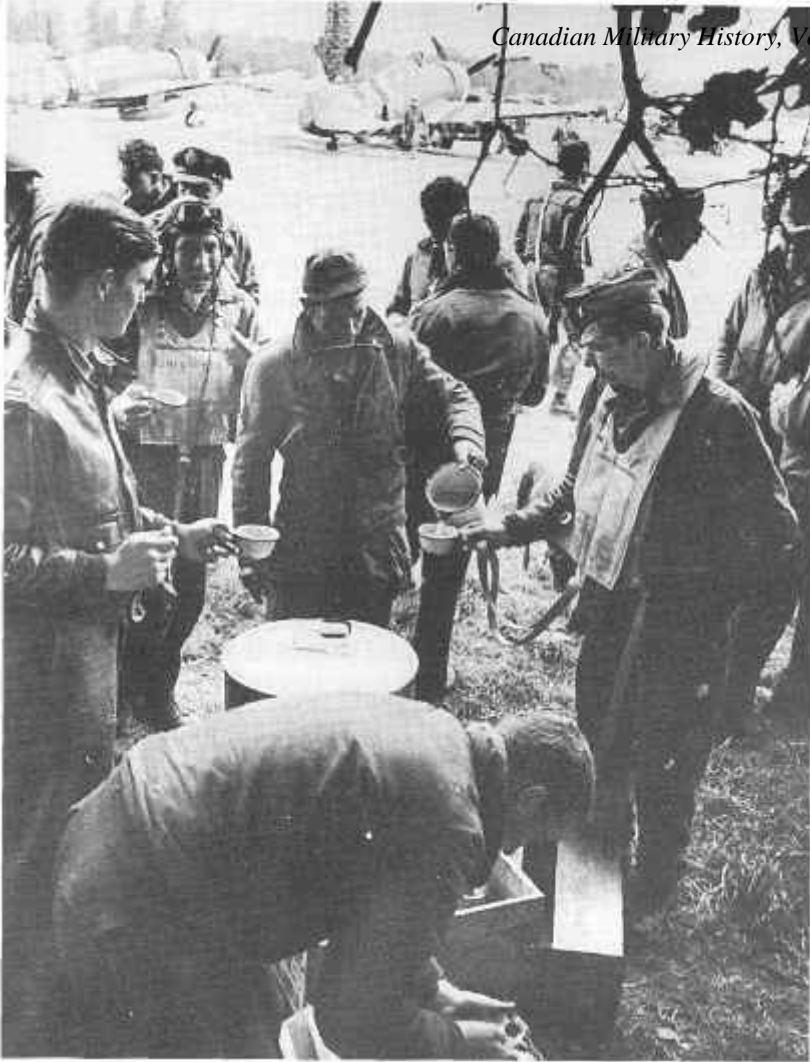
Ninth US Air Force fighter pilots, operating from one of the first airstrips in Normandy, join an early morning chowline for breakfast. The flightline of P-47 Thunderbolts is visible in the background.

Representative on each ship acted as air advisor to the commanding generals of the army, corps and divisions engaged in operations. All air cooperation requests that were sent direct to Uxbridge by Air Support Parties attached to the troops ashore were to be monitored and those that were deemed unnecessary, wasteful or too dangerous, were vetoed. As well, the air representatives could originate air support requests and convey information on weather and the bomblines to the Air Force. 11 The Senior Air Representative also had a direct role to play in battle.