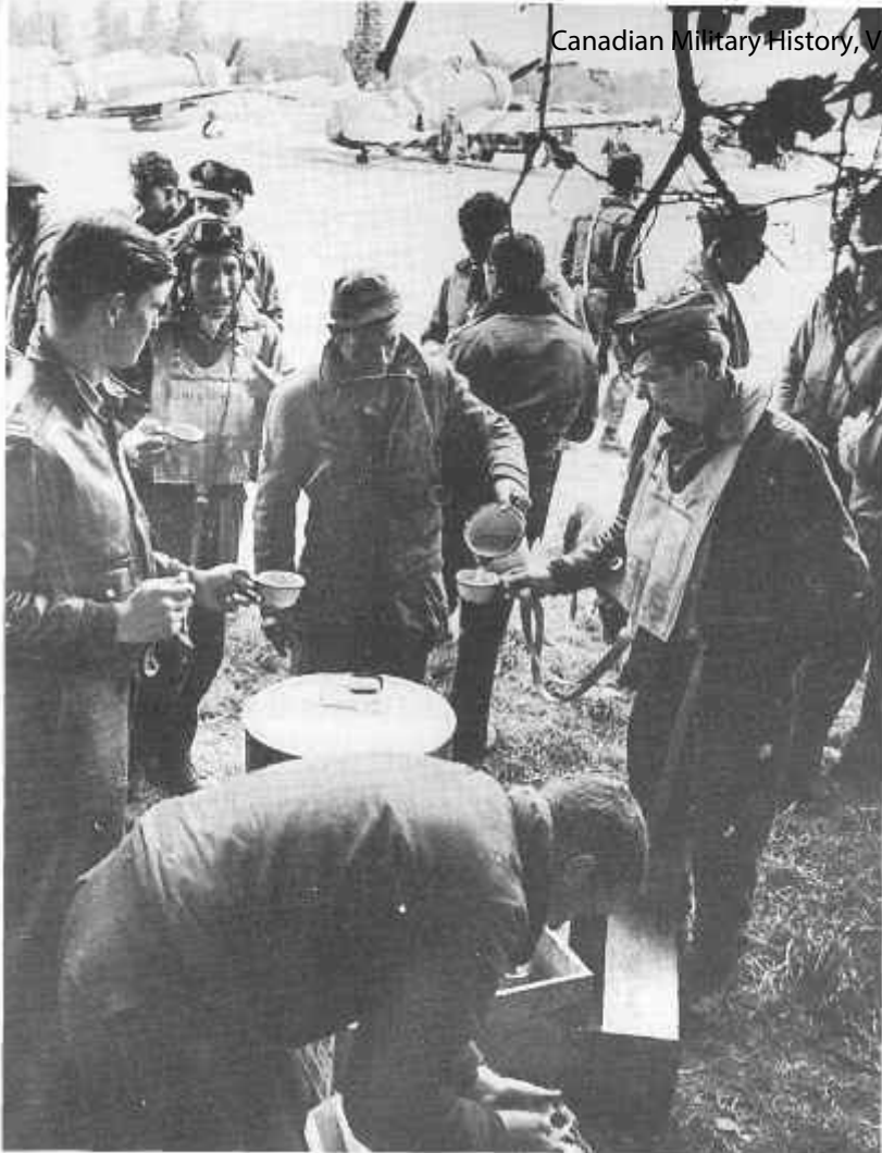
Ninth US Air Force fighter pilots, operating from one of the first airstrips in Normandy, join an early morning chowline for breakfast. The flightline of P-47 Thunderbolts is visible in the background.

Representative on each ship acted as air advisor to the commanding generals of the army, corps and divisions engaged in operations. All air cooperation requests that were sent direct to Uxbridge by Air Support Parties attached to the troops ashore were to be monitored and those that were deemed unnecessary, wasteful or too dangerous, were vetoed. As well, the air representatives could originate air support requests and convey information on weather and the bomblines to the Air Force. 11 The Senior Air Representative also had a direct role to play in battle.