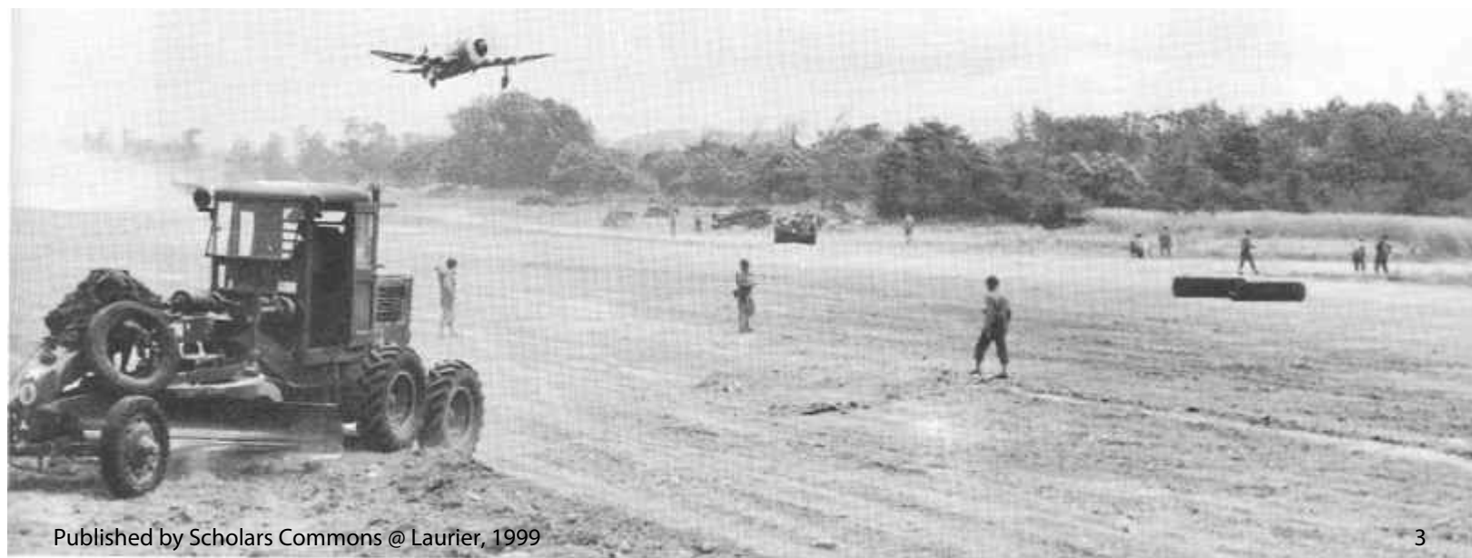
A P-47 Thunderbolt takes off from a frontline landing strip after being refuelled and rearmed by mechanics of the 9th Air Force Service Command. The strip is still in process of construction and work goes on despite aircraft landing and taking off.

I n the early morning of 6 June 1944 the Allies launched the largest amphibious landing in history. By the end of the day, a foothold on the continent had been achieved. However, it would take nearly two months of intense combat to break out of the beachhead and a further six weeks to send the Germans into a headlong retreat towards Germany. During this period, IX Tactical Air Command (IX TAC) in cooperation with the First United States Army (FUSA) evolved an effective system of close air support that greatly facilitated the winning of the war.