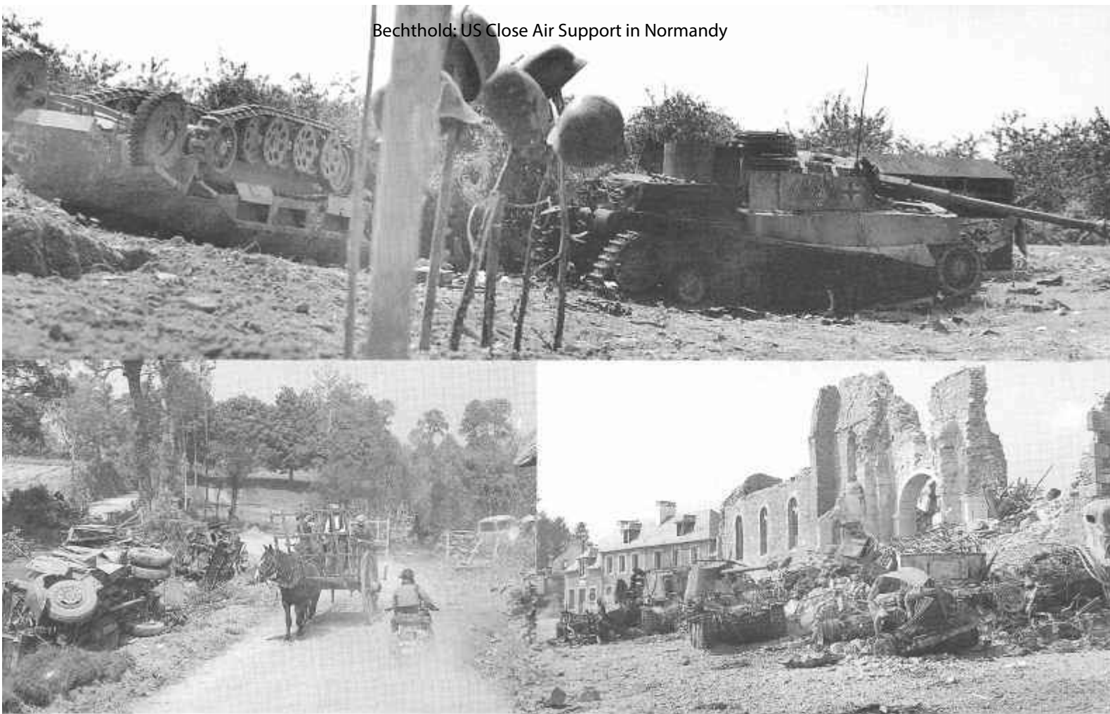
Scenes of destruction in the Roncey Pocket. Top: A German half-track (likely overturned by aerial bombs) and a knocked-out Panzer Mark IV tank bear silent witness to a row of German graves. Above left: A French farm cart and an American dispatch rider pass by smashed German transport just outside of Roncey. Above right: Wrecked German armour and transport in the square at Roncey.

received artillery support from the self-propelled guns of the 78th Armoured Field Battalion and air support from a squadron of IX TAC P-47s tasked to fly ACC for Combat Command B. German resistance crumbled in the face of this concerted attack. 45