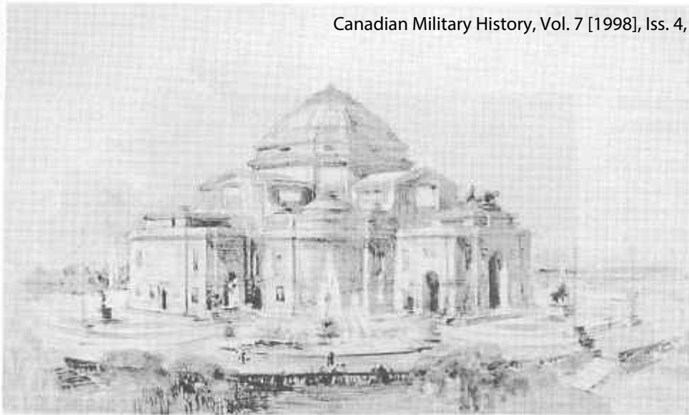
Left: General exterior view of the proposed Canadian War Memorial Building.