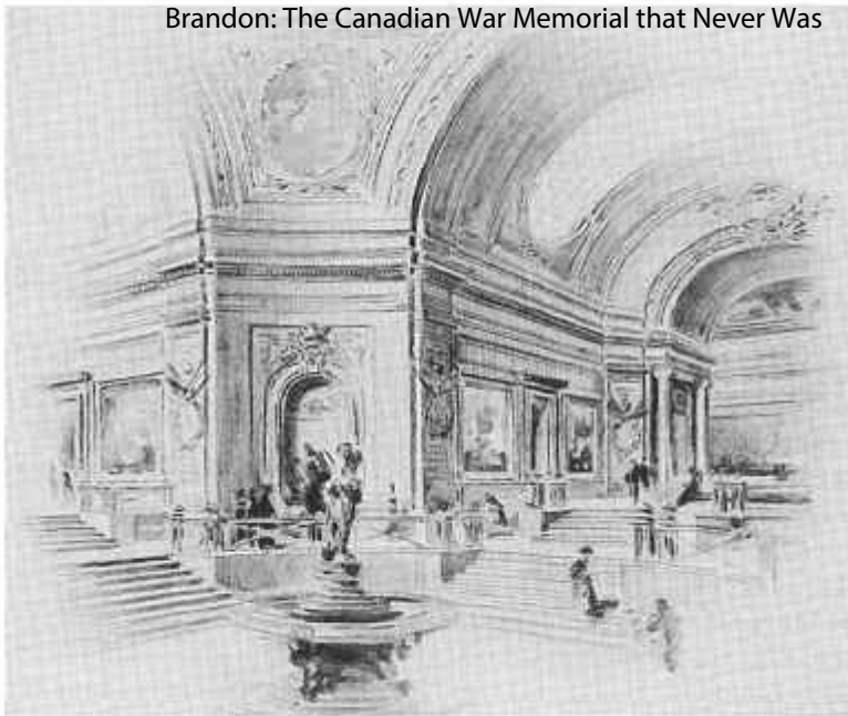
Interior perspective of the Canadian War Memorial Design.