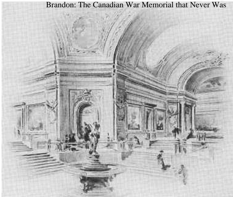
Interior perspective of the Canadian War Memorial Design.