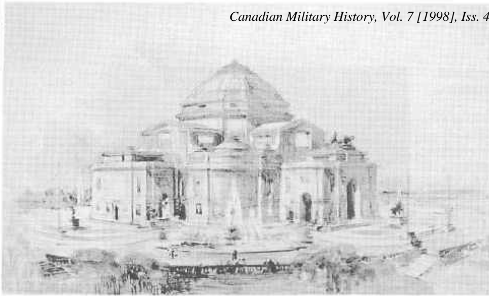
Left: General exterior view of the proposed Canadian War Memorial Building.