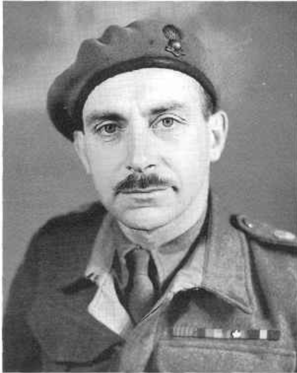
Douglas Harkness, photographed in 1945 when he was the Commanding Officer of the 5th Anti-Tank Regiment. In 1943, while a major with the 1st Anti-Tank Regiment, his heroic actions helped to save the lives of countless soldiers when the MV Devis was sunk by a U-Boat attack. He was awarded the George Medal for his valour.

a very powerful effect on group behaviour...Contrary to some initial presumptions, calmness rather than violent rage may therefore be more characteristic of the courageous act." 11