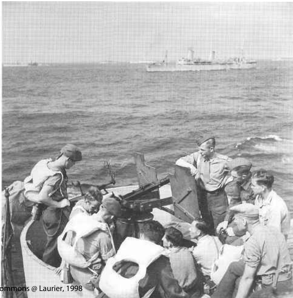
Men on board a ship on the convoy to Sicily receiving instruction on the use of an Oerlikon anti-aircraft gun.

Courage has many definitions depending on the danger faced. A general hallmark of true courage, however, is the ability to act calmly and deliberately in a life threatening situation to save the lives of others. As noted by one author, "both fear and calmness are contagious. Thus, an example of calm behaviour under fire can have