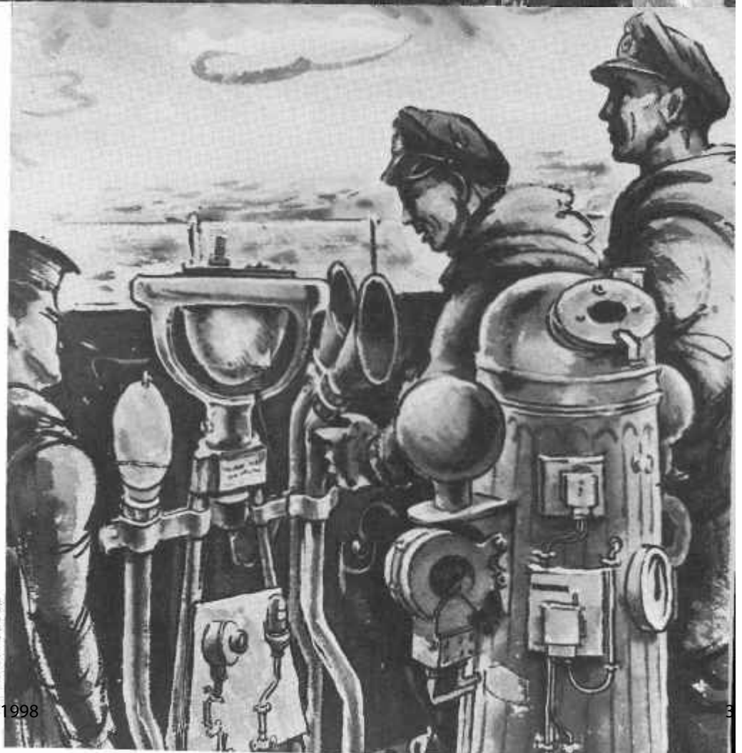
Right: Frigate's Bridge