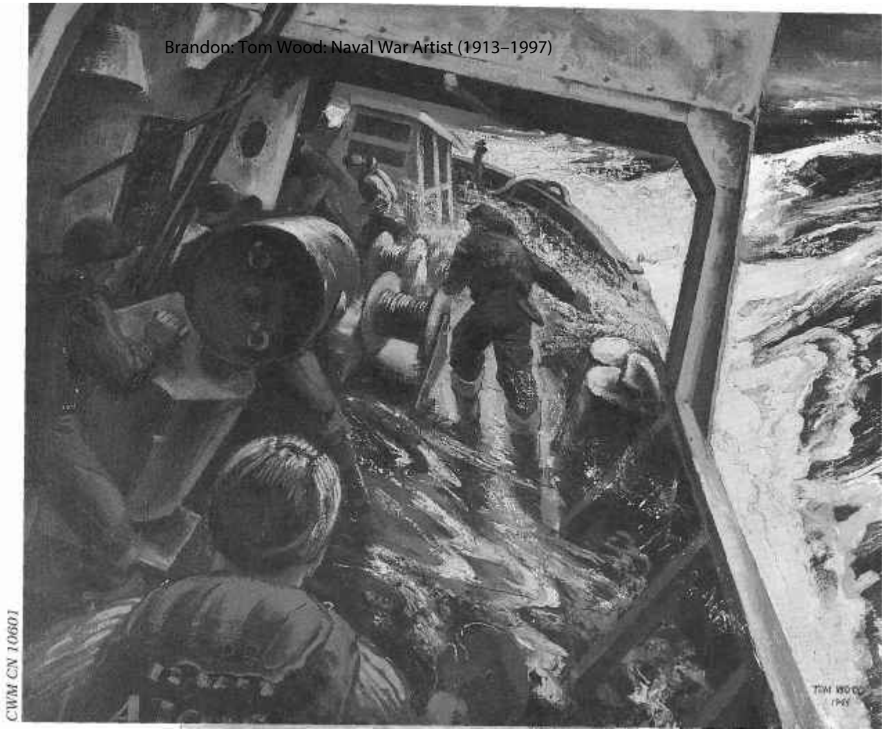
Above: Quarter Deck of HMCS Drumheller