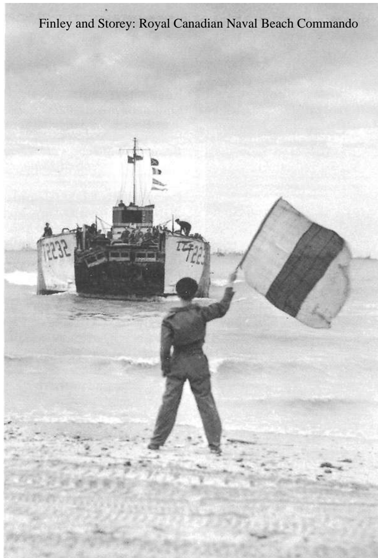
An unidentified member of Beach Commando "W" waves in LCT #2232.

Towards the end of March, "W" Commando learned that its present accommodation was required for operational Landing Craft Infantry (Large) LCI(L) flotilla crews and staff. About this same time, SO(CO) advised his superior, SCNO(L) - Senior Canadian Naval Officer, London - that while "W" was definitely the spare Commando in Force J and as such would not take part in any main assault, "it is most likely, however, that the party will be required for a diversionary assault such as Salerno or Anzio." Early in April "W" moved to HMS "Lizard" at Hove.