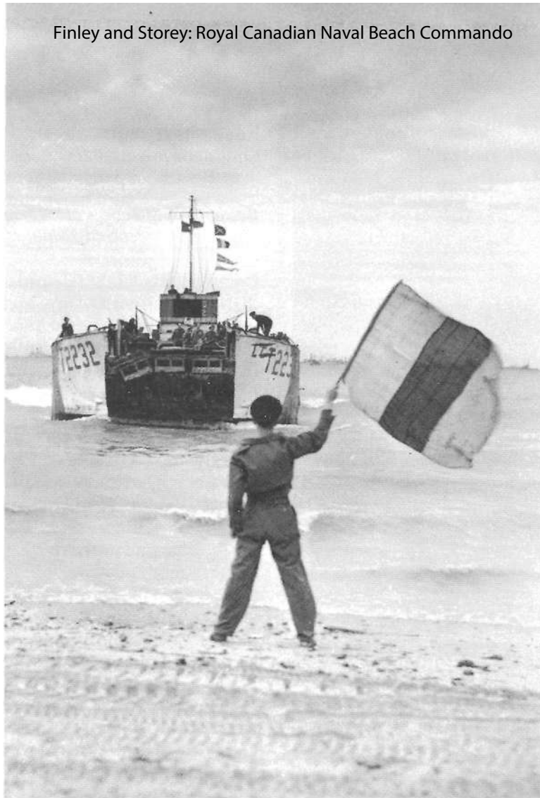
An unidentified member of Beach Commando "W" waves in LCT #2232.

Towards the end of March, "W" Commando learned that its present accommodation was required for operational Landing Craft Infantry (Large) LCI(L) flotilla crews and staff. About this same time, SO(CO) advised his superior, SCNO(L) - Senior Canadian Naval Officer, London - that while "W" was definitely the spare Commando in Force J and as such would not take part in any main assault, "it is most likely, however, that the party will be required for a diversionary assault such as Salerno or Anzio." Early in April "W" moved to HMS "Lizard" at Hove.