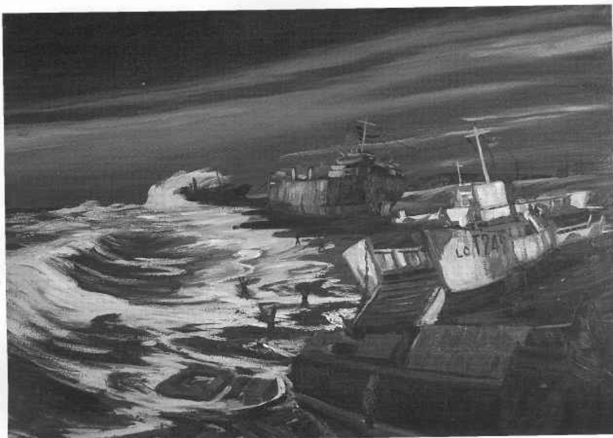
The Gale of Hurricane Force on the Normandy Beach.