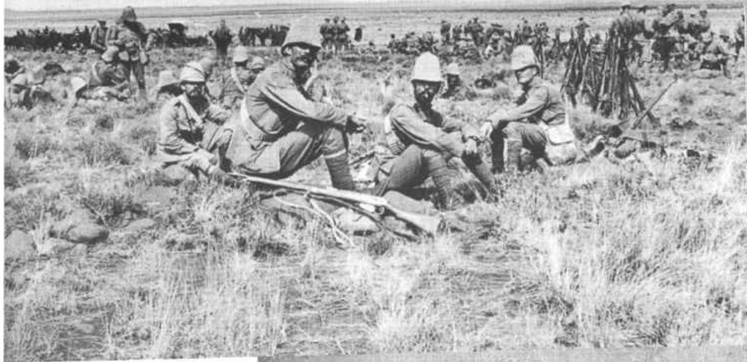
Above: A group of soldiers from the Royal Canadian Regiment rest on their way to Paardeberg, February 1900.