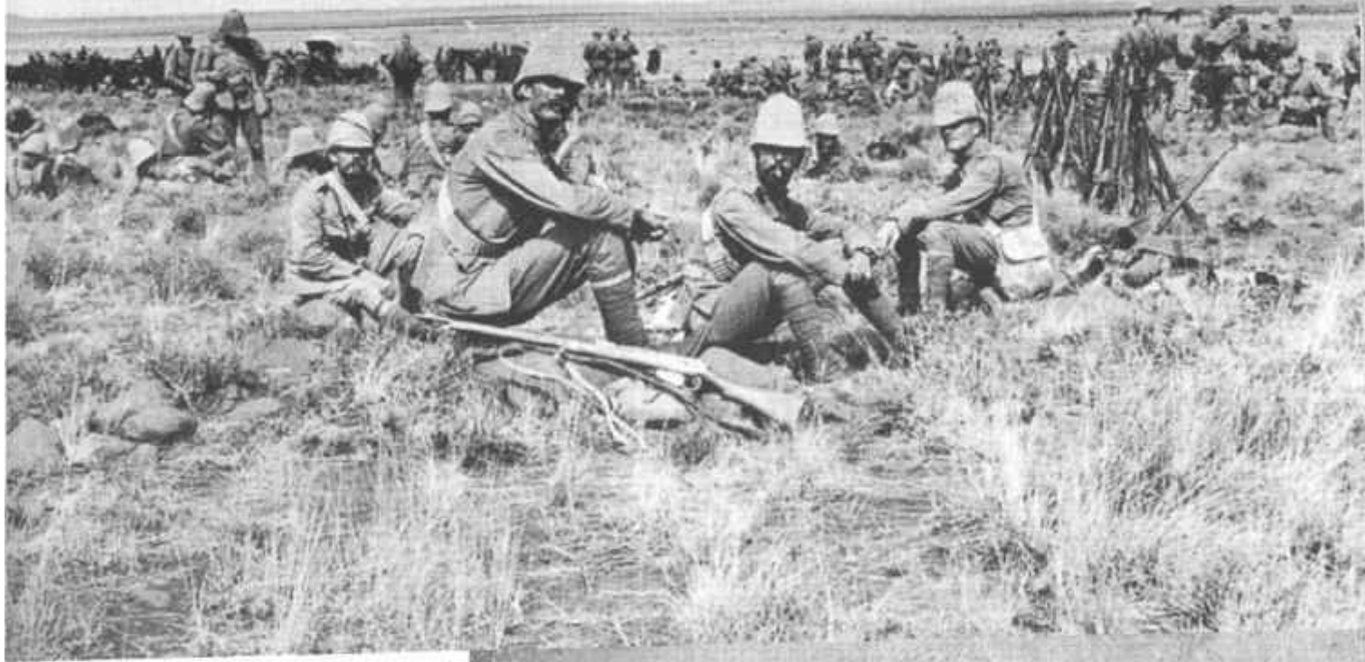
Above: A group of soldiers from the Royal Canadian Regiment rest on their way to Paardeberg, February 1900.