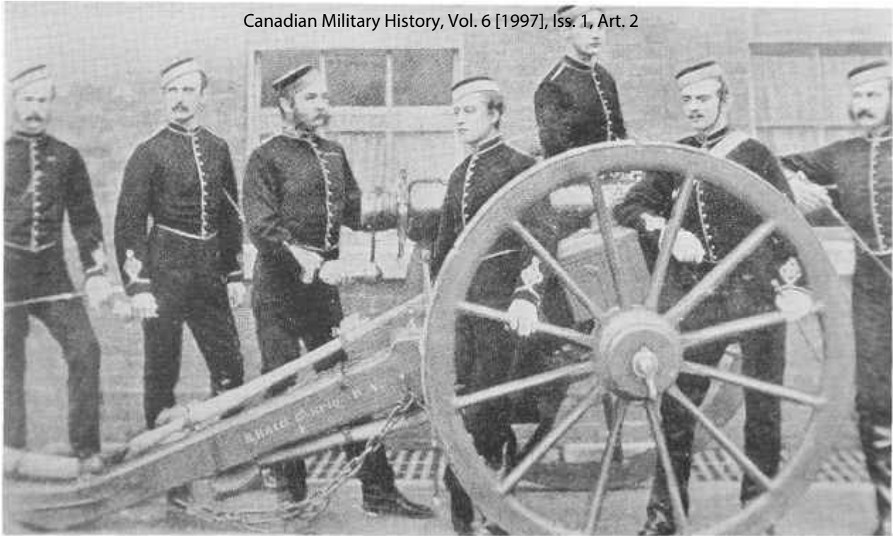
Officers of the Royal Horse Artillery in undress uniform, c. 1860.