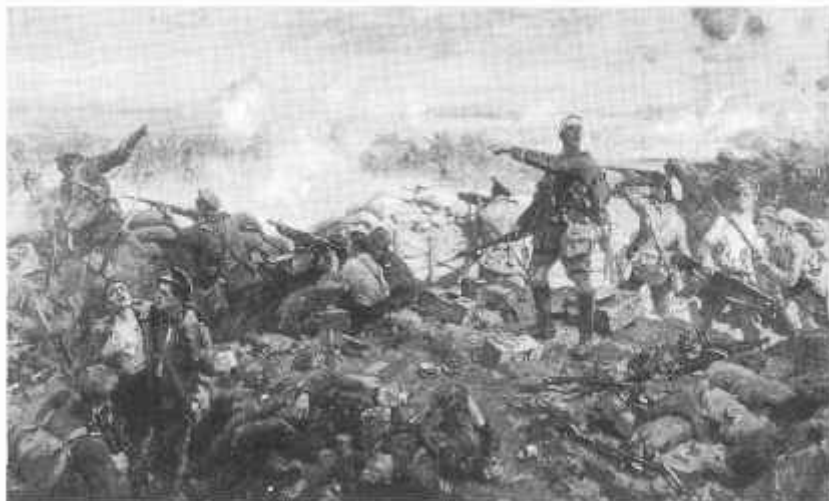
Second Ypres. by Richard Jack (Canadian War Museum)