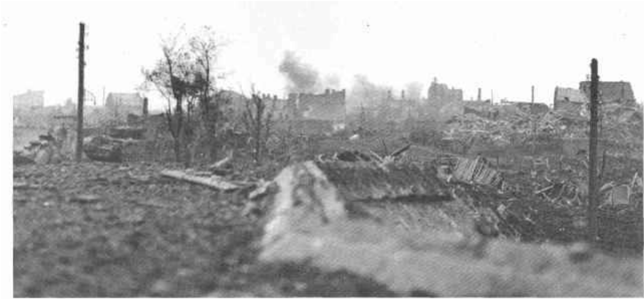
Artillery shells landing in Breskens, 22 October 1944. Note the Churchill AVKE at the left side of the photo.