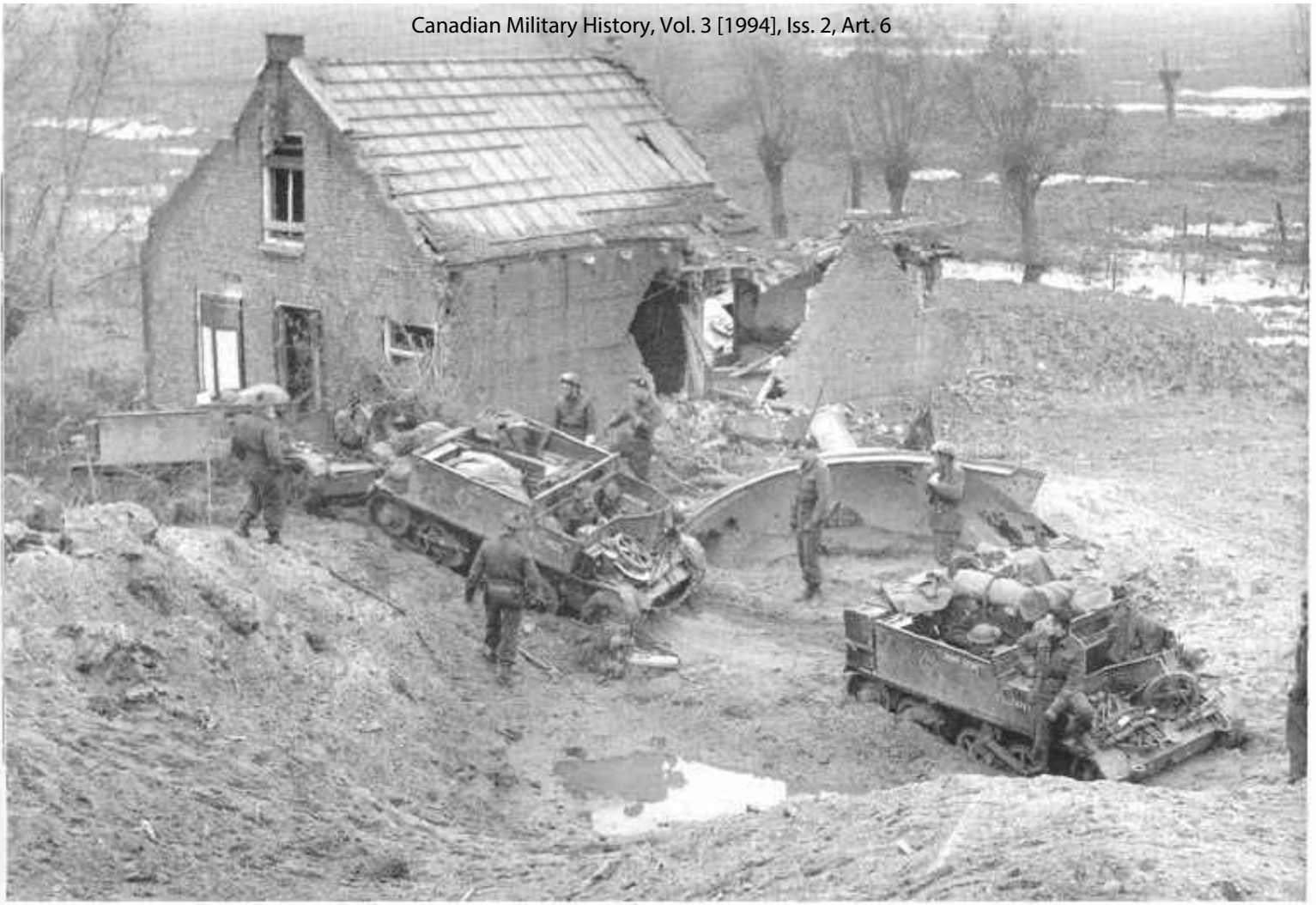
Canadian carriers move through the wet, muddy, flat ground near Breskens, 28 October 1944.