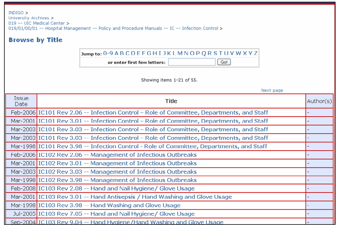
Figure 6. Example of a collection of policies sorted by title.

The policies can also be sorted by date. DSpace permits a keyword search of the metadata records that can be structured so that a single collection, a community, or the entire institutional repository is searched