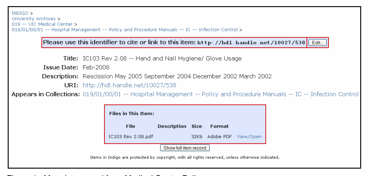
Figure 4. Metadata record for a Medical Center Policy.