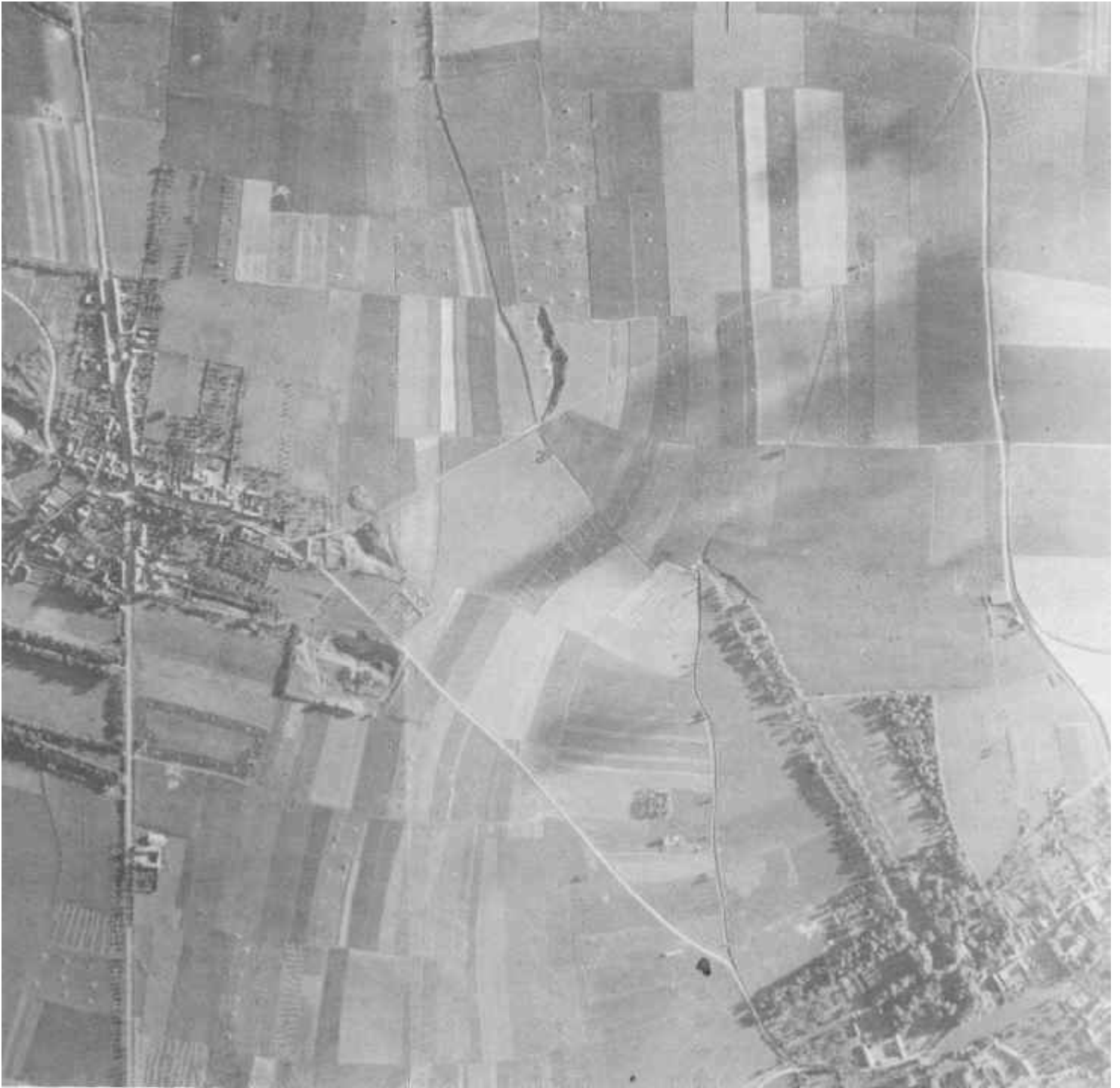
May-sur-Orne (left) and Fontenay-le-Marmion (right). The "factory" south of St. Martin may be seen at the top of the photograph. Note the shape of the fields in the centre which correspond to the crest of Verrieres Ridge. The minor road running northeast from May was the Black Watch start line.