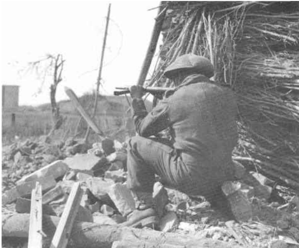
Canadian soldier in May-sur-Orne