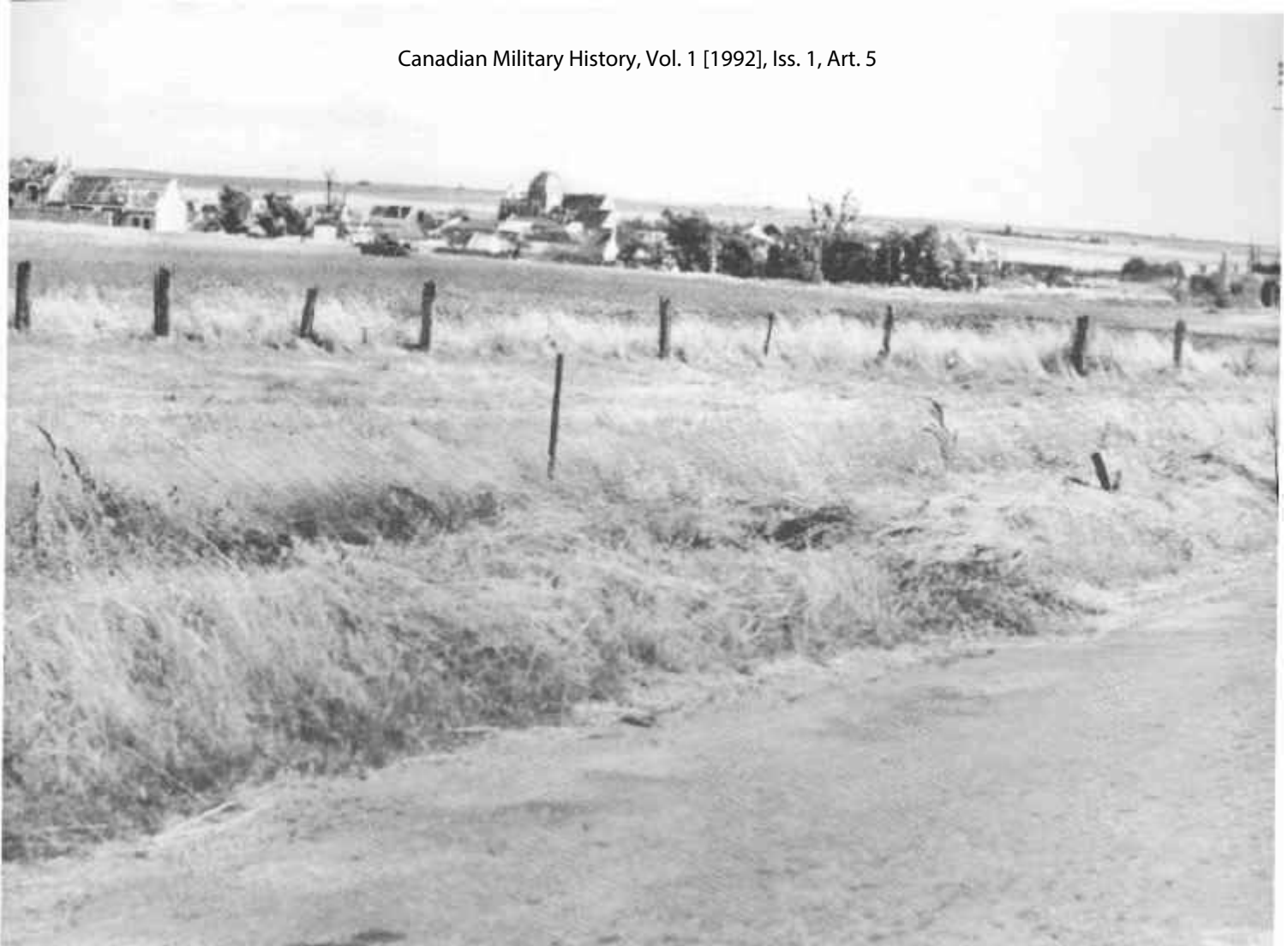
The church at St. Martin-de-Fontenay is in the centre of the photograph. Verrieres Ridge is in the distance. (Photo taken in 1946).