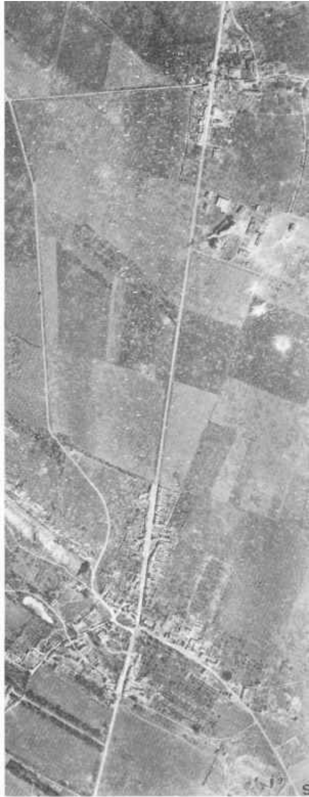
St Martin-de-Fontenay and the "factory" (top) and May-sur-Orne (bottom). Photo taken on 7 August 1944.