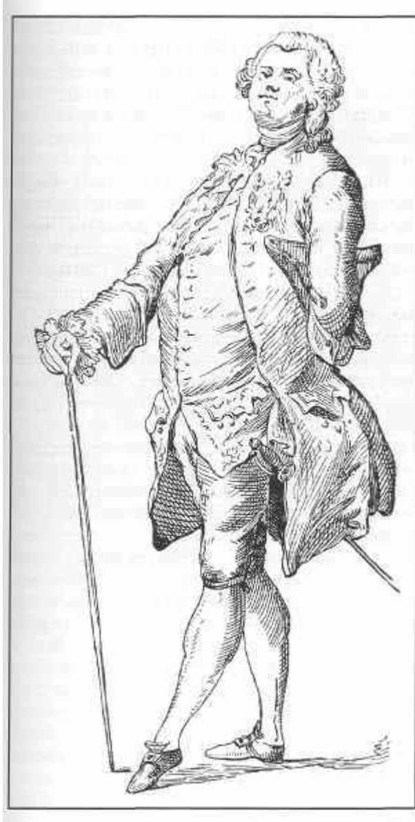
Francois Bigot