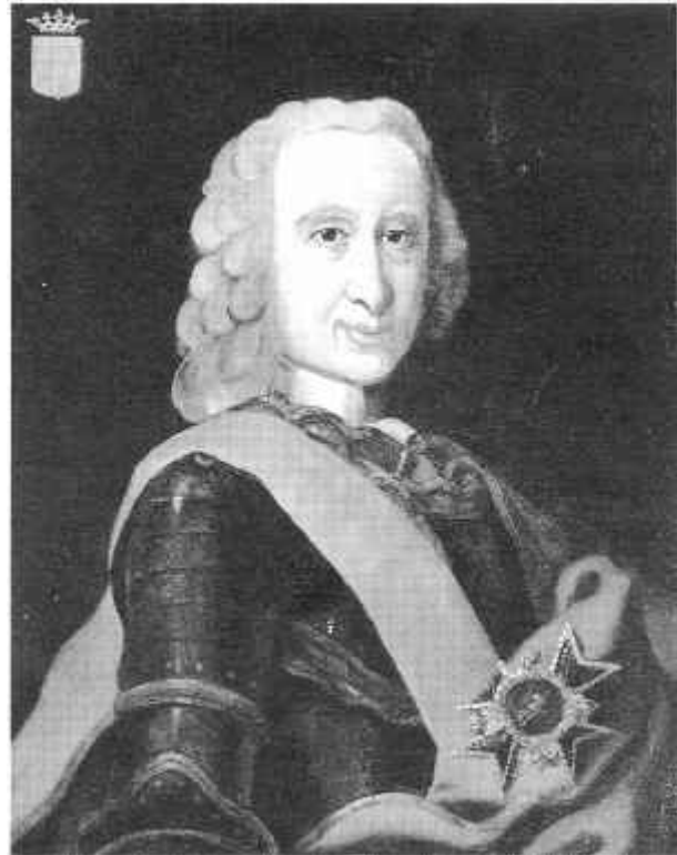
Pierre de Rigaud de Vaudreuil (Artist unknown, NAC CI 1243)

In September of 1759, the residents of the government of Quebec found themselves under the rule of an occupying army. Out of a range of possible responses, from violent