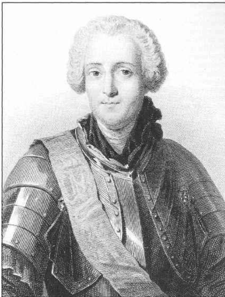
François de Lévis (painting by J. Parreau, NAC C34215)

British at Quebec, however, was more permeable than the wilderness separating New France and New England. Here, war was conducted in a settled agricultural region where a semblance of normal life continued under British military occupation. Indeed, following the capitulation of Quebec, a flourishing commerce had developed between the French and British zones. By 25 November, Murray was angrily aware "that the [British] merchants, ever greedy of gain, to purchase furs had transmitted a good deal of cash to Montreal." 16