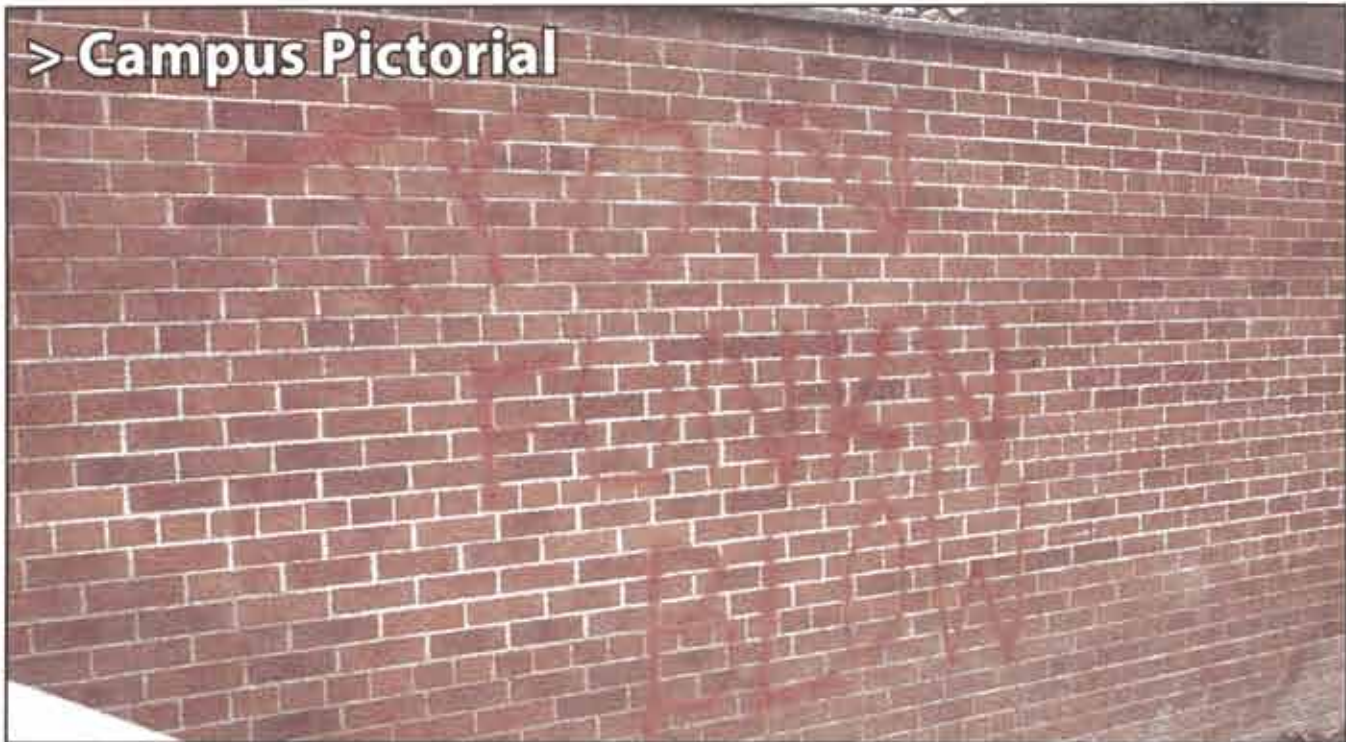
> Campus Pictorial GIVE'R 2 UR LIVER - Alright, who let the first-years watch "FUBAR" and order Dial-a-Bottle? Stuffing a pillow in a fridge and nearly burning down a residence is one thing, but please, have a little more Canadian Excellence.

It was simply another act of unmonitored stupidity that happened to get out of control. It wouldn't have happened if students were more respectful of their neighbours in residence, and if residence security had any measure of control over what goes on. This incident puts the spotlight on how ineffective security is in residences at Laurier.