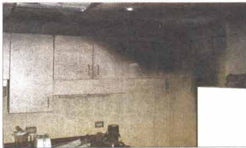
SMOKED OUT - Top: The light bulb from a residence fridge ignited a sofa cushion. Bottom: Smoke damage from the fridge fire.

Belanger said that he has heard from a lot of angry parents. "They're all concerned - as you'd expect."