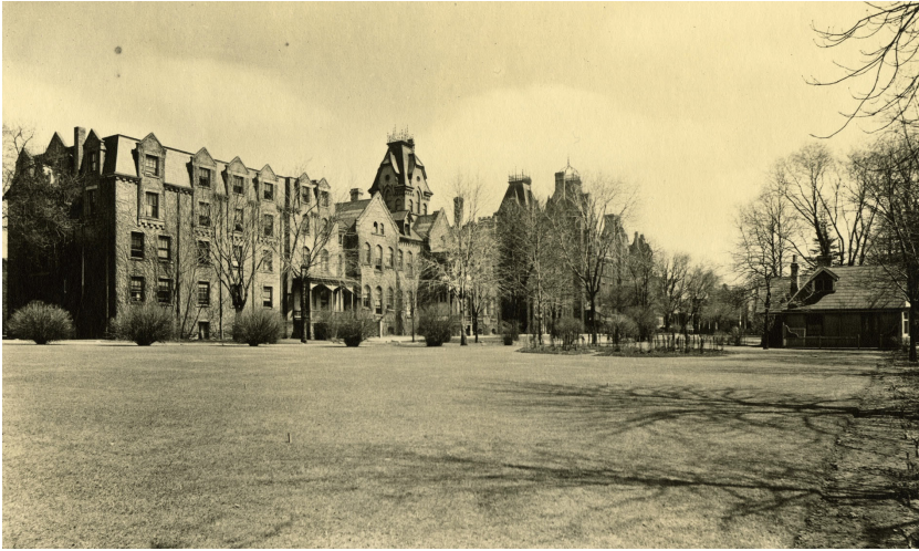
Figure 2. Photograph of the Military Base Hospital, formerly the Toronto General Hospital around 1900 in Toronto, Ontario.

erected tents on the property, the hospital was able to serve 1,000 patients. The hospital building itself boasted an impressive twenty-two wards, strategically designed so that each floor could be shut off from the others to restrict interaction between patients. 17