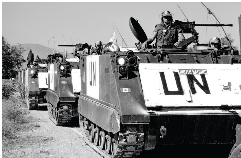
M-113 APCs of the Canadian Contingent on patrol near Nicosia. 28 August 1974.

alone, the bill topped $175 million. 57 Burdened by massive federal government deficits, Progressive Conservative Prime Minister Brian Mulroney struggled with the surging costs.