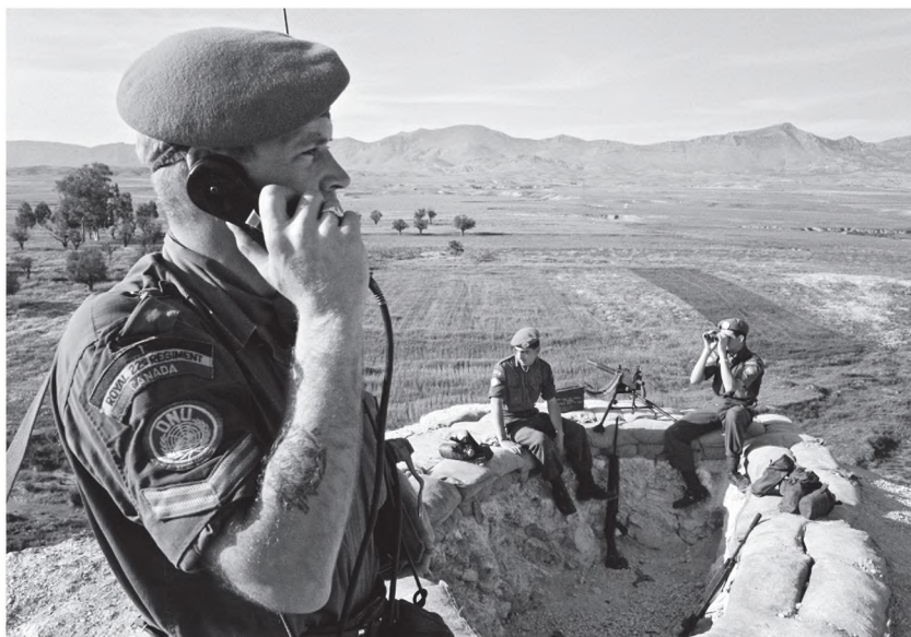
Members of the Canadian contingent serving with UNFICYP at an observation post in Trakthomas, Nicosia, Cyprus. 27 March 1964.

in Cyprus, the steady drain on Canada's coffers, and the growing fear that Canada's commitment to Cyprus, which still totalled over 500 troops in early 1974, might be permanent. Behind the scenes, Canadian policy-makers campaigned hard for financial reform and championed plans to restructure the United Nations Peacekeeping Force in Cyprus (UNFICYP) as a much smaller observer force in 1974, in 1978, and again, twice, in the 1980s. Their efforts were fruitless, dismissed by force commanders and UN experts as too risky, or opposed by Security Council members France and the Soviet Union, both anxious to avoid absorbing UNFICYP costs. 37