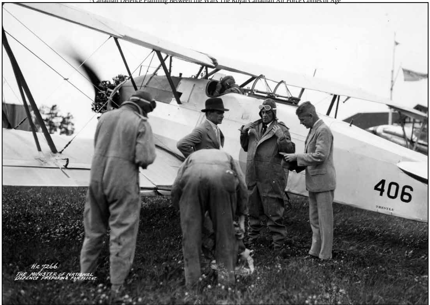
The minister of National Defence, Grote Stirling, prepares for a flight in an Armstrong Whitworth Atlas.

planning throughout the remainder of the 1930s concentrated. Coastal defence included, Walsh noted, "protection of important localities and ports from air raids, defence of the Pacific and Atlantic coasts by means of coast reconnaissance, anti-submarine patrols, co-operation with coast defence artillery, and protection of empire Air Routes and Convoys." 31 Seven Permanent Force squadrons were required to carry out the tasks, four of them controlled by Group Headquarters at Halifax and Vancouver, each with one bomber and one flying-boat squadron. The others were one army cooperation squadron which would maintain contact with the latest doctrine and equipment in the United Kingdom and provide a training cadre for Non-Permanent army cooperation squadrons required on