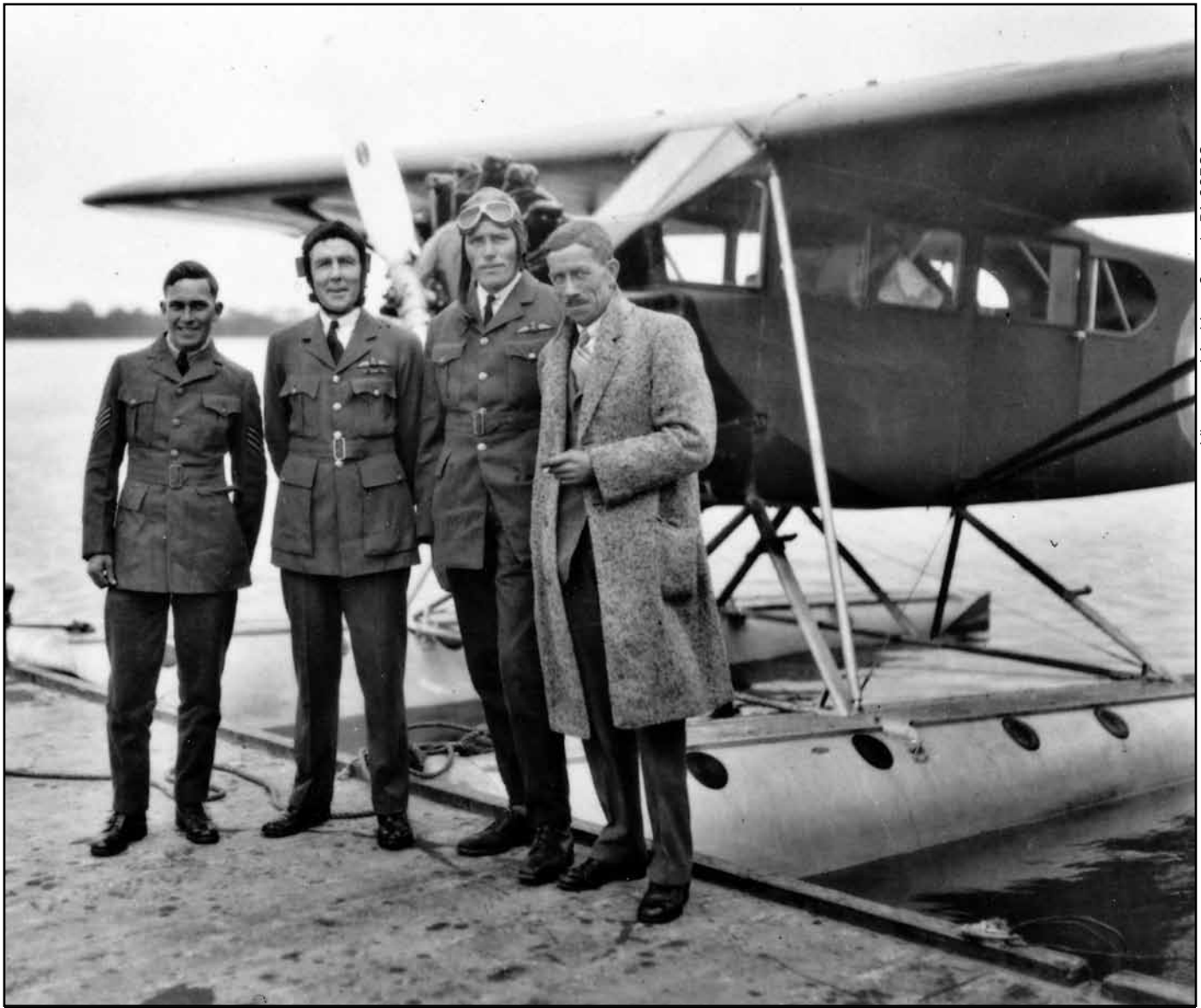
Library and Archives Canada PA 62588