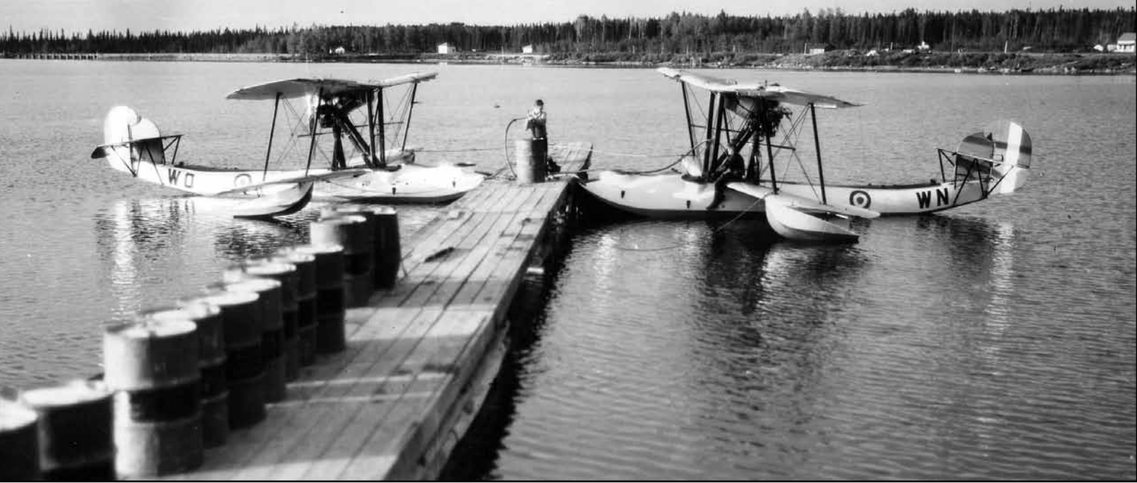
Two Vickers Vedettes of No.5 Photo Detachment moored to a dock at Long Lake, Manitoba. Civil flying operations in the Canadian north earned RCAF flyers the title of “bush pilots in uniform” during the 1920s.

true air power was only achieved through the independent use of the air arm. “Bombers, supported by fighters,” he wrote, “are the embodiment of air power which is applied by air bombardment.” While fighters provided the means for defence, which could be only partial at best, bombers were the prime weapon: