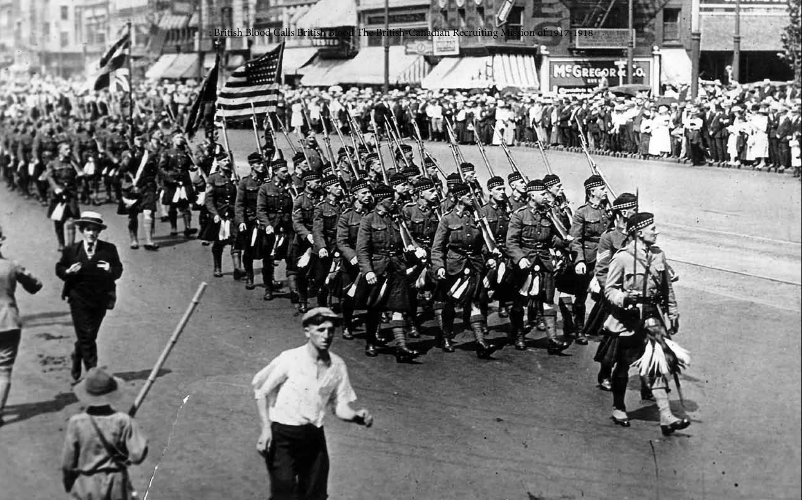
A marching contingent from the 48th Highlanders of Canada is greeted by large crowds in a US city, probably Chicago, circa 1917.