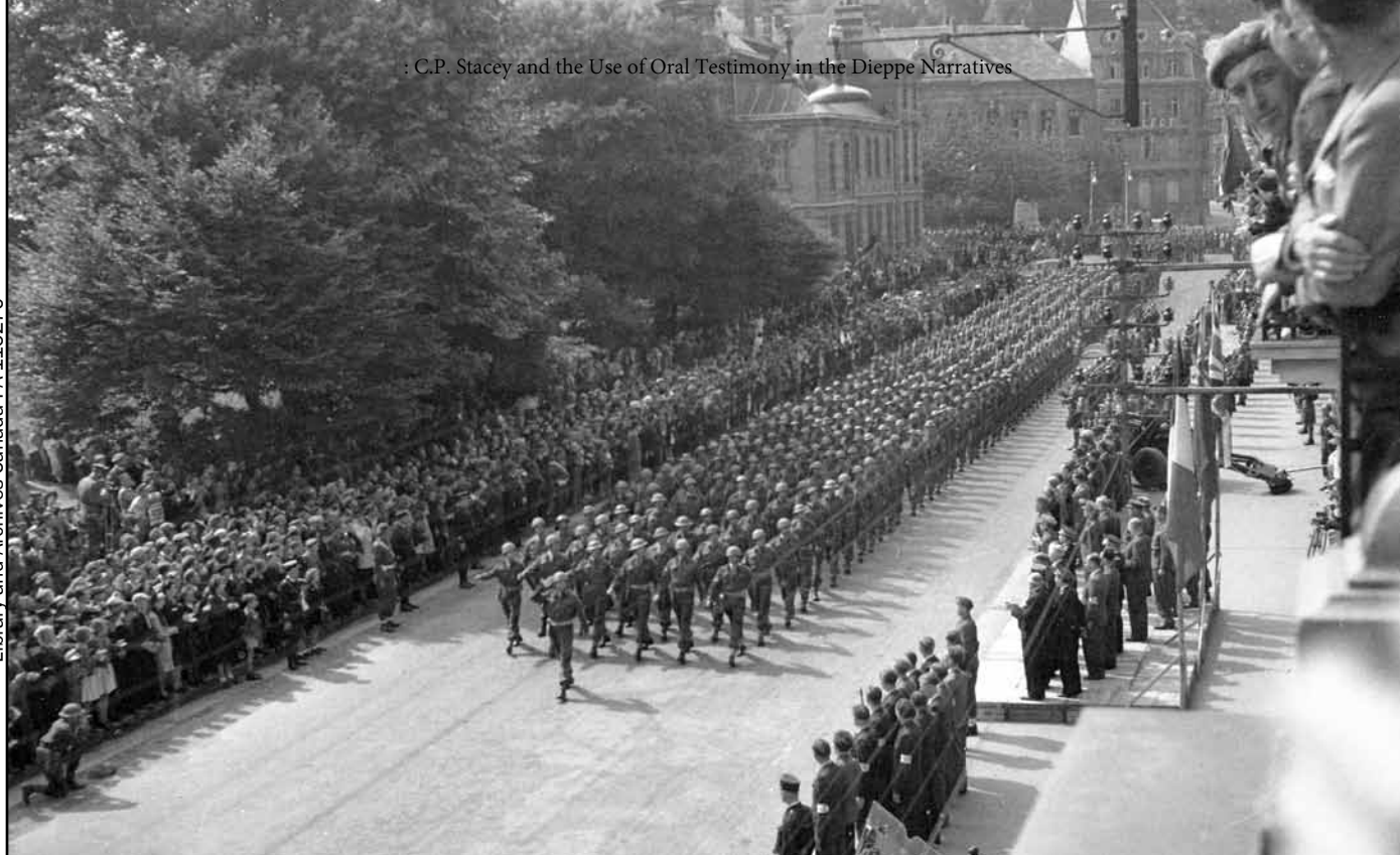
Second Canadian Infantry Division makes a triumphant return to Dieppe, 3 September 1944.