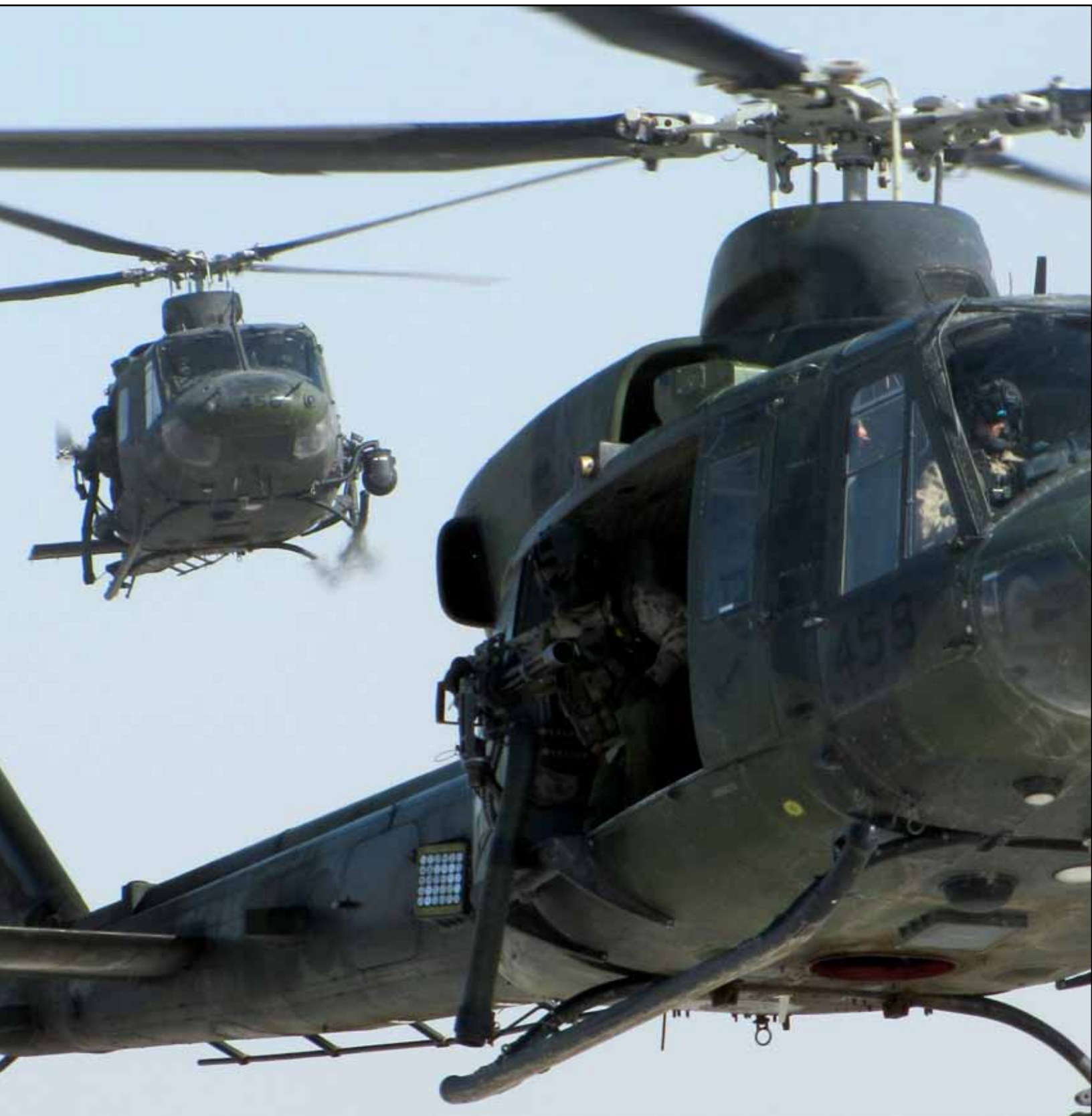
Two Canadian Forces Griffon Helicopters approach Kandahar Airfield after a Chinook escort mission in Afghanistan, 31 January 2010.