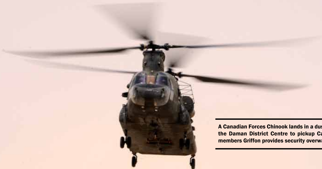
A Canadian Forces Chinook lands in a dusty field outside the Daman District Centre to pickup Canadian Forces members Griffon provides security overwatch.

The dragon symbol was probably inspired by the Taliban's reported description of the intense firepower brought down by the miniguns as the "Dragon's Breath of Alla."