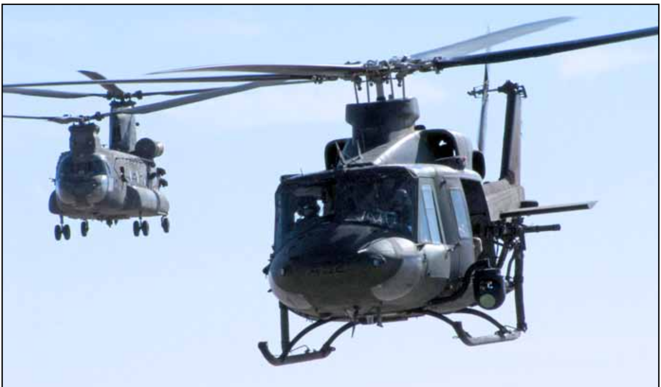
Below: A Griffon armed with a Dillon minigun escorts a Chinook on a mission in Afghanistan, January 2010.